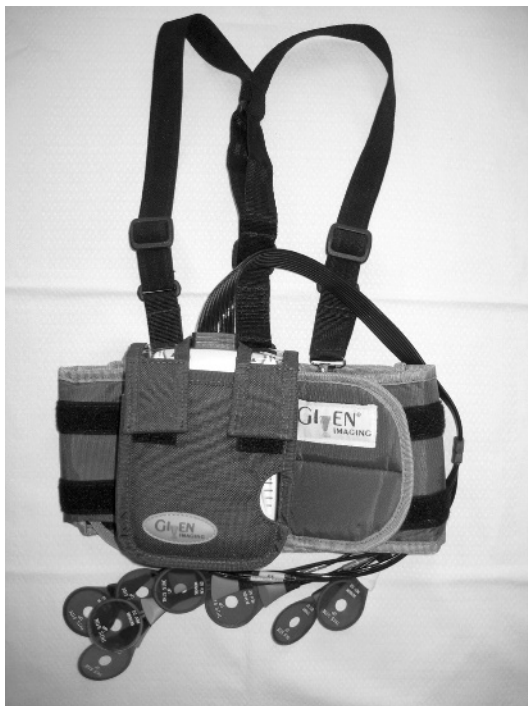
Figure 1 A custom-made rucksack for the batteries and recorder in small children.

All patients were given clear fluids for 24 h before the study and fasted for 12 h overnight prior to the study. Further