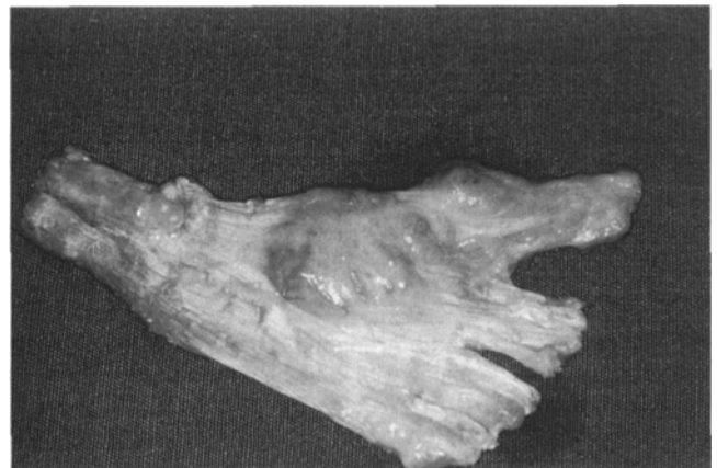
Fig. 3. (Same patient as Fig. 2) Resected specimen showing the lesion medially in the plantar fascia, with extension to the subcutaneous side. Treated by total plantar fasciectomy.

Operative treatment is indicated by pain and local aggressiveness. LEX and WEX showed identical rates of recurrence (7/9 vs 6/7) among our cases. Published reports indicate that WEX and extended PFC give better results than LEX alone. 4,5,10-12,15,20,22,32,35,37,40-42,45,46 In recurrent cases, complete removal of the plantar fascia and the fascial bands to the toes should be performed (Fig. 3). 43 In five of our cases, involvement of skin was evident. Four cases showed recurring disease after PFC, indicating that in these cases, partial skin excision and skin grafting might be necessary. There are reports that postoperative adjuvant treatment with radiation may influence the rate of recurrence. However, because the lesion is benign and radiation in the long term may lead to secondary malignancies, this should only be recommended for those who fail to respond to surgical treatment. 29