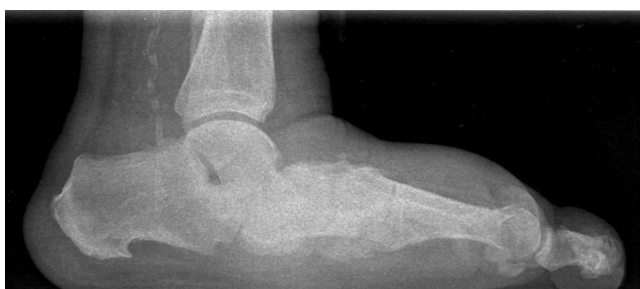
Fig. 1: A 65-year-old male with a 23-year history of type-II diabetes mellitus and pain in both feet. Radiograph shows damage to the arch of the foot resulting in a rocker-bottom deformity.

corresponding financial impact on national health-care systems. 3,5 These facts have contributed to fundamental changes in the management of Charcot neuroarthropathy of the foot in the last few years.