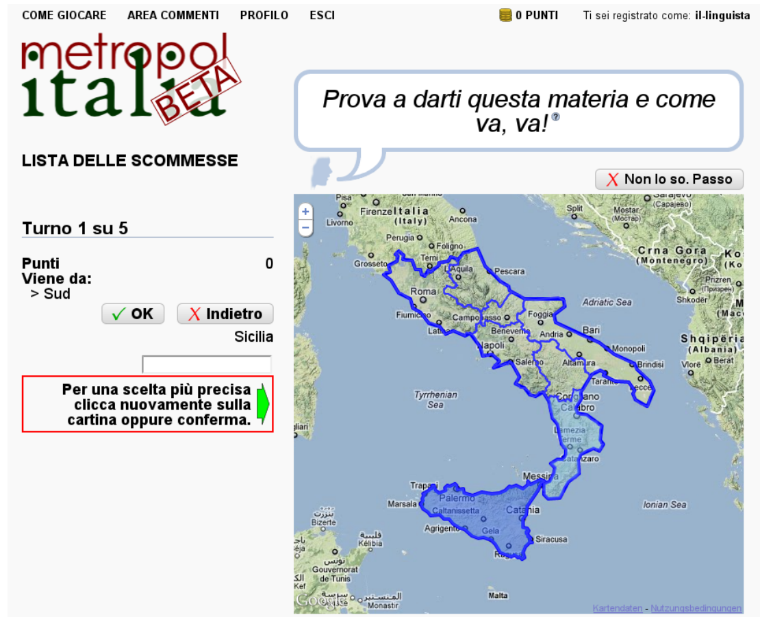
Figure 1: Borsa Parole during the choice of an area for the displayed sentence (in English “Try to take this exam, whatever may happen!”). The player is in round (“Turno”) 1 of 5 and achieved 0 points (“Punti”) so far. “Viene da” means “Comes from”, “Sud” means “South” (the current area selected), the buttons are “OK” and “Back”, and the request in the red box on the left hand side means “For a more precise choice click on the map again, or confirm.” The button above the map means “I don’t know. Skip”.