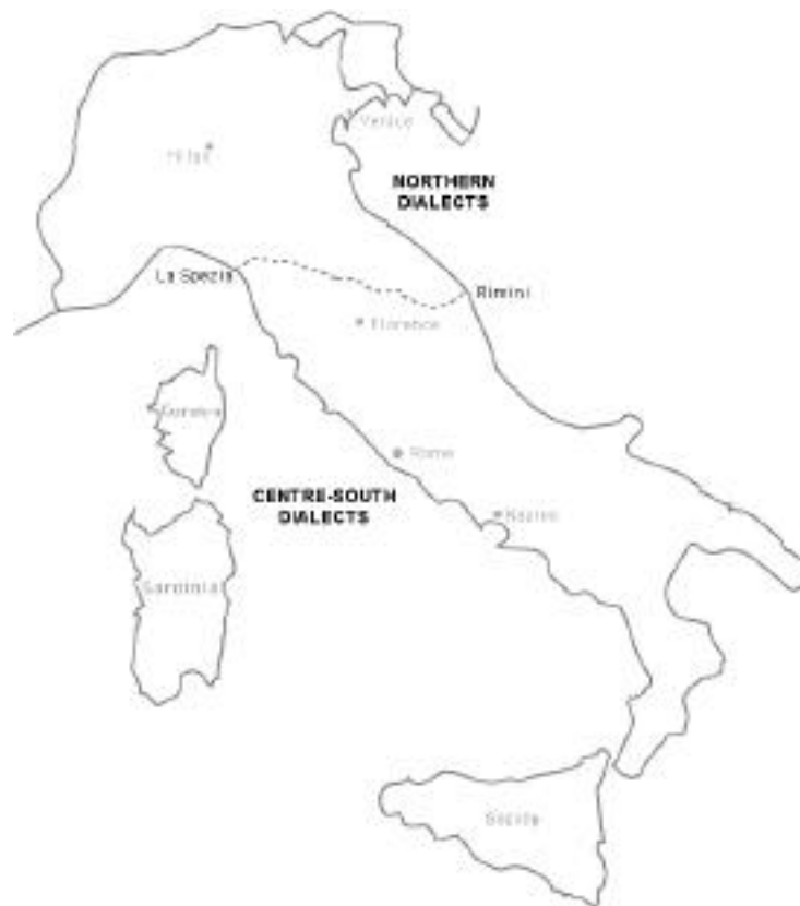
Map 1. Geographical distribution of RS.

RS is found throughout the Italian peninsula below the imaginary line running from La Spezia to Rimini as well as on the islands of Sicily, Sardinia and Corsica.