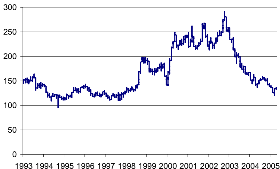
Figure 1: Yield Spread between US low grade Corporate Bonds and US Government Bonds

To estimate the effects of EMU on yield spreads, we introduce an EMU dummy that takes the value of one for the initial 11 EMU member countries starting in 1999 and for Greece starting in 2001 and zero otherwise. A significant coefficient on this dummy points to a general effect of EMU on yield spreads of all member countries. Furthermore, we interact the EMU dummy with the fiscal variables and the liquidity variable to see whether EMU has changed the effect of the fiscal variables and market liquidity on interest rates. Finally, all regressions are estimated with and without time and country fixed effects, \lambda_t and \mu_i . 7