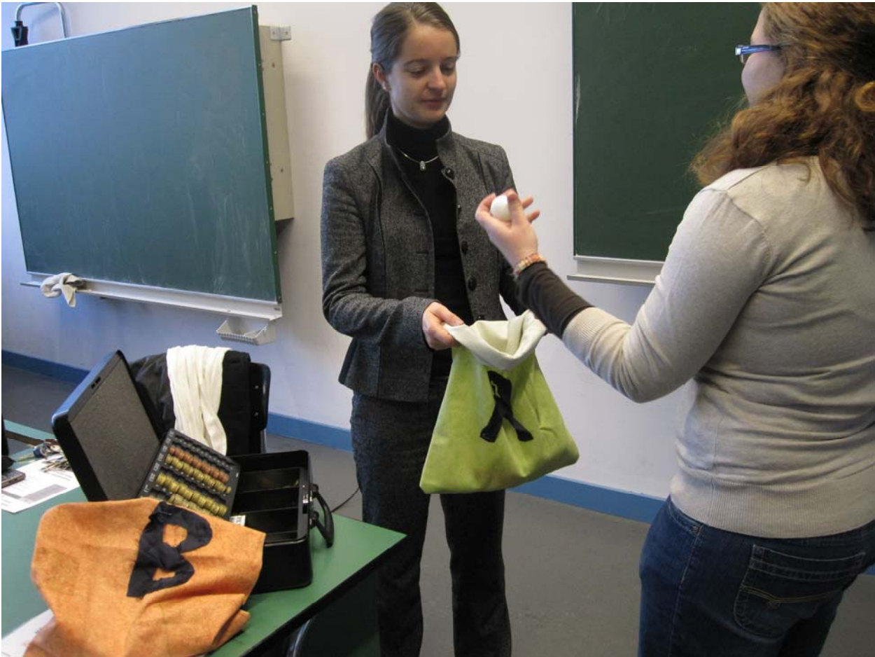
A photograph illustrating how participants drew from one of the bags (A or B)