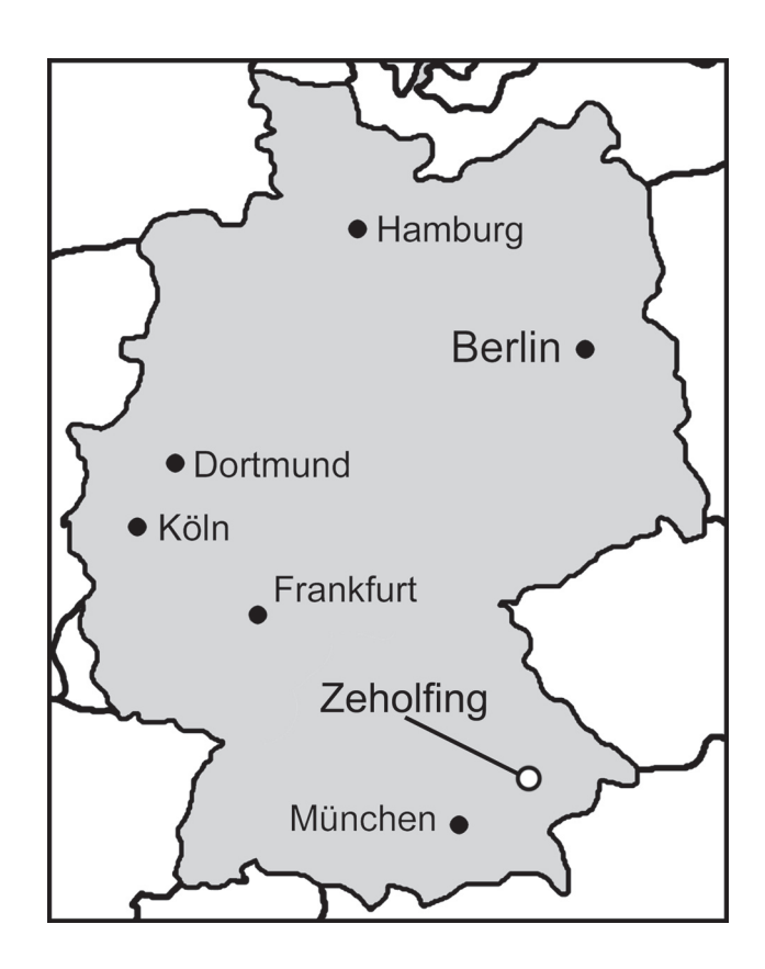
Figure 1: Geographical position: The village of Zeholfing is located in Lower Bavaria, ~120 km ENE of Munich.

Vessels variable in size, wood ring-porous; outline of the large vessels usually blurred by tangential deformation; commonly abrupt transition to the latewood of the same growth ring; earlywood vessels solitary and in radial multiples of 2(–3); vessels form a well-defined zone with 3–5 layers; diameter of solitary vessels tangential : radial (186–207) : (269–331) \mu m, diameter of radial multiples of two, tangential : radial (204–262) : (415–517) \mu m, multiple vessels with three pores tangential 220