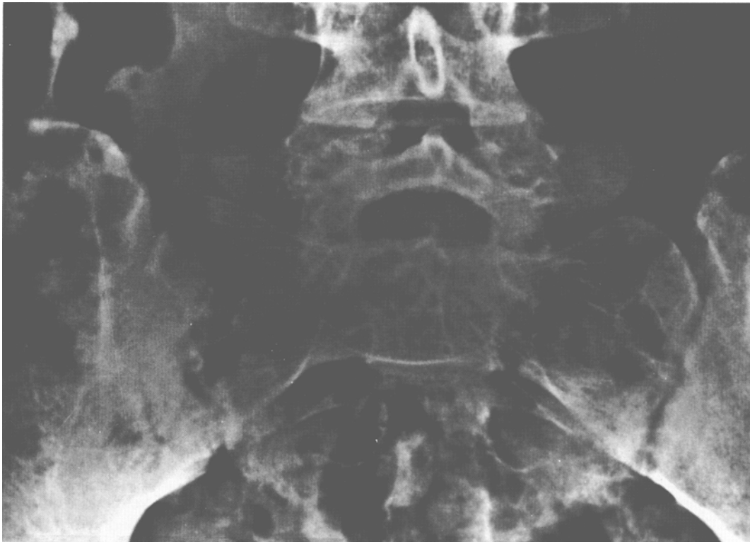
Fig. 1: Bilateral sacroiliitis on ap view.