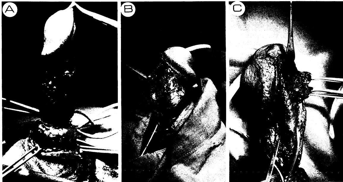
FIG. 2. A, circumcision is done and skin is drawn back to root of penis. B, dissection of corpus spongiosum. C, dissection of tips of corpora cavernosa (held by Allis clamps).

Venous leakage can be the sole or a concomitant cause of erectile dysfunction in men. Cavernosography and cavernosometry are of paramount importance in the diagnosis of abnormal drainage of the corpora cavernosa. 3 The majority of the patients will regain spontaneous erections after ligation of the dorsal veins of the penis. However, in the presence of distal venous shunts between the corpora cavernosa and corpus spongiosum other surgical measures are required. To date only Ebbehøj and Wagner have reported on 4 patients with distal venous leakage operated on by dissection of the glans dorsally. 7 By this means they transected the venous shunts. However, this dorsal approach includes the danger of injury to the dorsal nerves, which are responsible for sensitivity of the glans. Moreover, venous shunts between the distal portion of the corpus spongiosum and corpora cavernosa may be missed. This is not the case when spongiosolysis is performed. Complete transection of all venous leaks is guaranteed by careful dissection of the distal half of the corpus spongiosum and glans. This result could be demonstrated by postoperative cavernosography in every operated patient. Therefore, spongiosolysis could be the treatment of choice in patients with distal venous leakage. A larger number of patients and long-term followup are necessary to confirm these preliminary results.