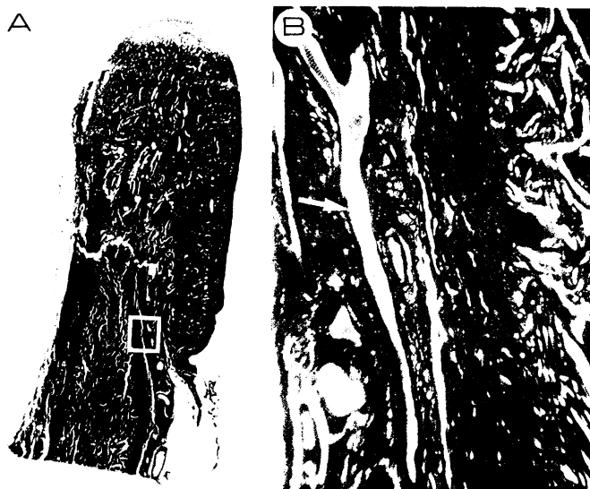
FIG. 1. A, longitudinal section of distal portion of penis. H & E, reduced from \times 1 . B, inset from part A shows slightly dilated vein (arrow) adjacent to tunica albuginea of corpus cavernosum. H & E, reduced from \times 14 .

To date 5 patients 34 to 45 years old have undergone spongiosolysis (see table). In all patients ligation of the dorsal veins