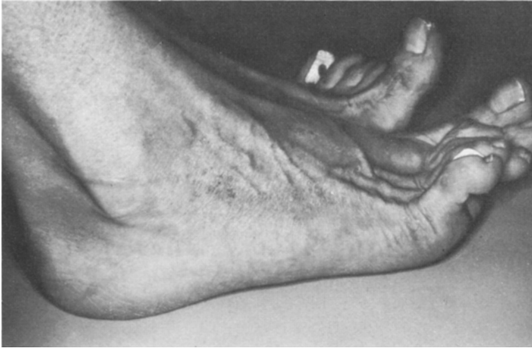
Fig. 2. Atrophy of the right extensor digitorum brevis muscle in Case 2

increased with the exception of the right deep peroneal nerve. The latency for this nerve was extremely prolonged to 16.1 msec. A right anterior tarsal tunnel syndrome and a discrete distal polyneuropathy of the lower extremities were diagnosed in this case.