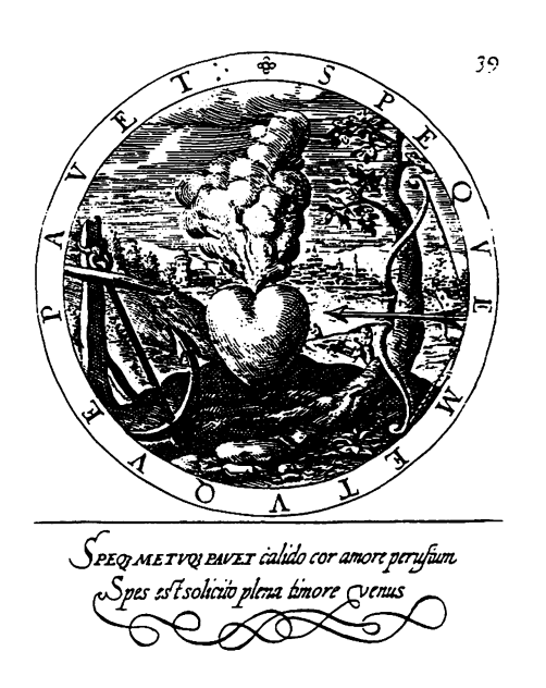
Fig. 2. Gabriel Rollenhagen, Nucleus Emblematum, acters and events of the 1,39. Old and New Testa-

to the structure of the victura. As scholarly discussion has shown, the designation "ideal type of the emblem" can be misunderstood. 14 In view of the intense discussion of the term "typology" in German philology, 15 it is advisable to restrict the use of the adjective "typological," which was already used by Schöne in this connection when he talked about a typological interpretation, 16 to the typological relations between the char-Old and New Testaments.