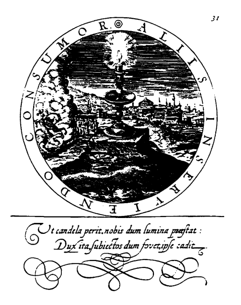
Fig. 14. Emblematum, II,31.

of the falling millstone. They can be regarded as a second element of meaning with the task of modifying, or accentuating differently, the emblematic main element of meaning. However, it is also possible that a second element of meaning with the same significance