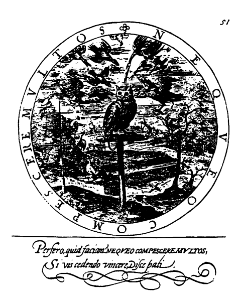
Fig. 13 Gabriel Rollenhagen, Nucleus Emblematum, 1,51