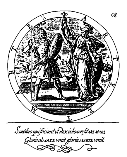
Fig. 5. Gabriel Rollenhagen, Nucleus Emblematum, I,68.