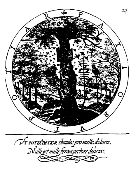
Fig. 12. Gabriel Rollenhagen, Nucleus Emblematum, I,23.