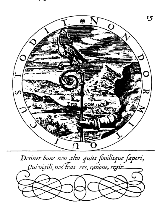
Fig. 7. Gabriel Rollenhagen, Nucleus Emblematum, II,15.

Mixed types of the hermeneutic, the allegorizing and the exam-