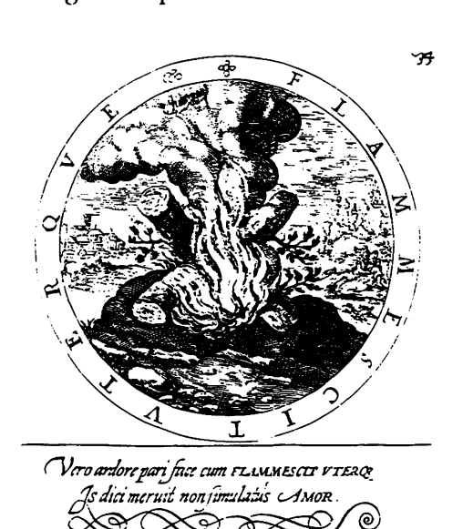
Fig. 15. Gabriel Rollenhagen, Nucleus Emblematum, 1,34.

several birds swarming around it aggressively. Some of them have already settled next to the owl onto a pole covered with bird lime, and in so doing, have already fallen victim to the bird-catcher's trick. This motif appears in emblem I,51 (Fig. 13) as the main element of meaning and is interpreted in the subscriptio <sup>28</sup> as triumph through complaisance.<sup>29</sup> In the background of this emblem, the