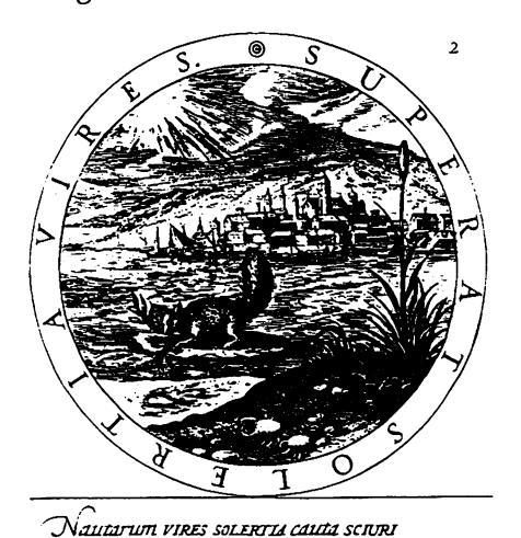
Fig. 11. Emblematum, II.2.

the foreground of a picture can represent different partial pictures side by side which, while possessing an informative value of their own, are only held together by the integrative power of the frame which the landscape provides and which they all share. In this way the Sisyphus-emblem, for example, depicts two scenes from the myth, namely Sisyphus on his toilsome way to the top of the mountain and the frustrating final outcome of his efforts which have to be repeated time and again: having reached the summit Sisyphus has to watch his stone rolling back down the mountain. This kind of combination of partial scenes from one course of action can be considered as a simultaneous depiction of events. Such a simultaneous depiction is also provided by the elephant-emblem (II.49 [Fig. 10]) which shows in the foreground skilled hunters who are sawing into a tree-trunk while in the background the consequences of this action are to be seen: the elephant has fallen over together with the thus prepared tree. Now, we know from the natural science of classical antiquity that elephants lean against a tree when they want to sleep, and that they can be easily caught when they have fallen over together with the tree because they do not have the joints which