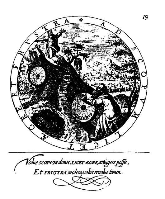
Fig. 9. Gabriel Rollenhagen, Nucleus Emblematum, type with hermeneutic I,19.

Barthélemy Aneau, Chiron is aiming at the sky with bow and arrow 22 but this is not the case in Rollenhagen's sketch. Here, snake and bow cannot be made to function on the level of potential facticity, but are employed merely because they are able to refer to prudence and strength. They therefore resemble the allegorizing attributes that are usually added to personifications. 23