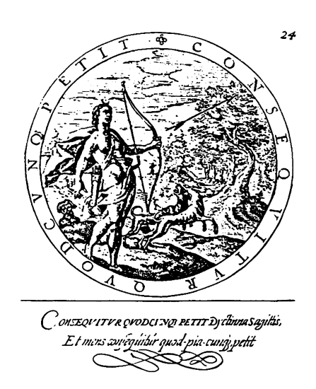
Fig. 6. Gabriel Rollenhagen, Nucleus Emblematum, 1,24.