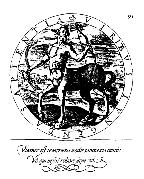
Fig. 8. Gabriel Rollenhagen, Nucleus Emblematum, spective emblem as her-I,91. meneutic. However,

ical theory, this crosier can be considered as a metonymy in the sense of an "actual interweaving of social phenomenon and symbol."20 According to the theory of natural science transmitted from classical antiquity, the crane is holding a stone in its talon in order to stav awake. This image can claim potential facticity; and if it were the only element of meaning, as is often the case in other emblems,<sup>21</sup> we would classify the remeneutic. However, the combination of an