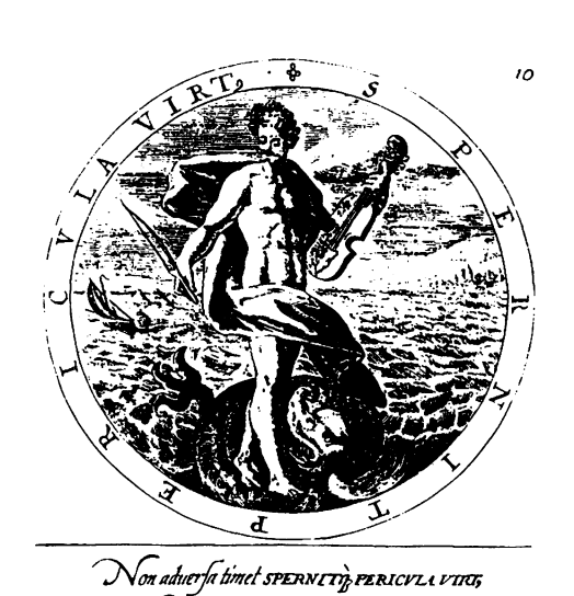
Fig. 4. Gabriel Rollenhagen, Nucleus Emblematum, I,10.

The third type is not employed as frequently; I would like to term it "exemplary" or "example-emblem." Here "example" is under-