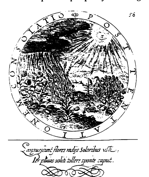
Fig. 17. Emblematum, I,58.

consolatio" [Trial is followed by consolation]. Antithesis can also be employed between different picture elements of the allegorizing type. In emblem I,90 (Fig. 18), which symbolizes the transitoriness of mankind and the immortality of the soul, a snake-ring as a sign of eternity is encircling a flowering rose which stands for transitoriness. Whether this antithesis is also taken up in the background scenes cannot be determined exactly. While it is true that on the right-hand side the birth of a child seems to be depicted, the scene on the left can hardly be understood as representing a funeral.<sup>34</sup> Antithetical structure is also employed in the pictura of emblem II,33 (Fig. 19) which illustrates the motto "Fures privati in nervo publici in auro" [He who steals private property wears fetters, he who embezzles public property wears golden chains] by showing in the