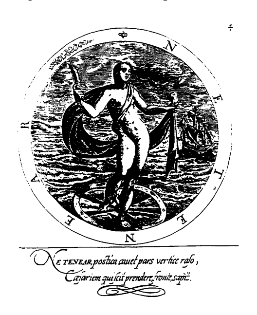
Fig. 3. Gabriel Rollenhagen, Nucleus Emblematum, 1,4.

For the second type of emblematic form I would like to suggest the term "allegorizing emblem." This type embraces combinations of significant single elements, that is to say allegorical or still life groupings. The only criterion for the arrangement of the single elements is the meaning which the emblem is intended to convey. The problem of potential facticity is irrelevant for this type; priority of the picture is out of the question because the starting point is the