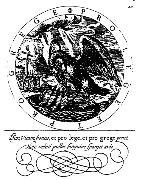
Fig. 16. Gabriel Rollenhagen, Nucleus Emblematum, II,20.

place of a second emblematic element of meaning in the background. Thus a burning candle, symbolizing a sovereign who sacrifices himself for his people, is depicted under the motto "Aliis inserviendo consumor" [In the service of others I consume myself] in emblem II,31 (Fig. 14). While the scenic background is probably without significance and may perhaps be attributed to a certain horror vacui , there is, on the left-hand side of the picture, a rider on a horse which