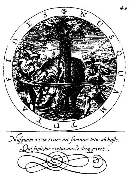
Fig. 10. Emblematum, II.49.

tion into account, Sisyphus is no longer a mere example of laborious effort but an example of the untiring virtuousness of the devout. <sup>25</sup>