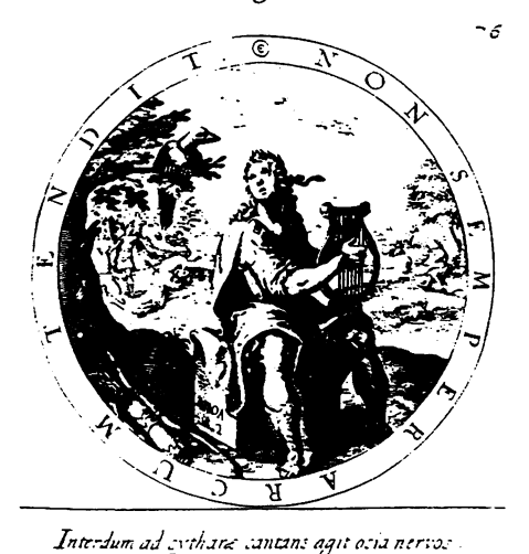
Fig. 20. Emblematum, II.76.

a short summary. In terms of the kinds of main elements of meaning, we can distinguish between the hermeneutic, the allegorizing and the (rarer) example-emblem; mixed types of these three basic types are also possible. The basic types may be furnished with different additional elements and background scenes. The background can be made up of an irrelevant landscape, or can contextualize the element of meaning; but, in addition, it can also provide a second element of meaning (above all in the form of an example) or antici-