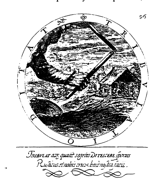
Fig. 1. Gabriel Rollenhagen, Nucleus Emblematum, I,96.

Although I consider both Schöne's notion of the ideal type and Daly's typological emblem as a distinct formal type to be entirely reasonable, I prefer to use the term "hermeneutic emblem." This designation takes account of the fact that we have to proceed from the idea of the priority of the picture, that is to say, from the emblem-