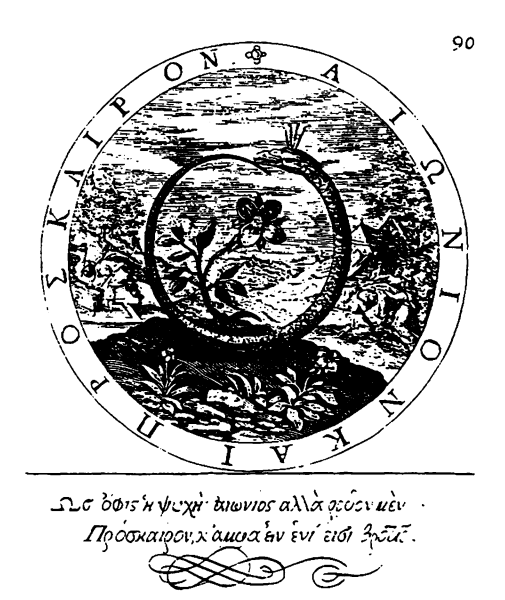
Fig. 18. Gabriel Rollenhagen, Nucleus Emblematum, 1,90.