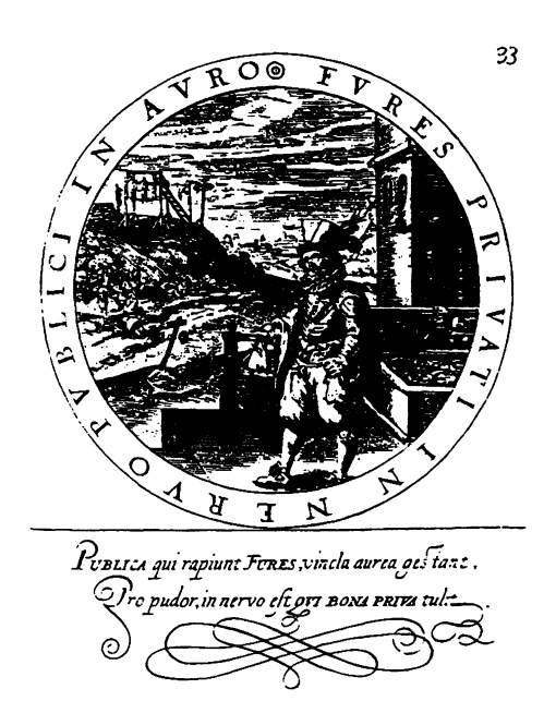
Fig. 19. Gabriel Rollenhagen, Nucleus Emblematum, II,33.