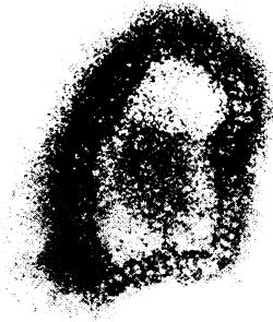
Fig. 1. Negatively stained preparation of a fecal sample from a moor macaque ( Macaca maura ). The particle is of typical coronavirus morphology, but details of the projections can not be defined. Bar represents 100 nm

demonstrate antigenetic relationships to established coronaviruses. Therefore the nature of these particles remains unclear.