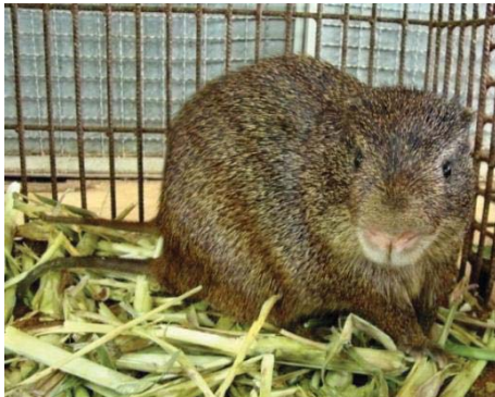
Photo 1. Growing Grasscutter

The grasscutter is a rodent herbivore recently domesticated in several countries of sub-Saharan Africa for meat production. However, the development of this production to a rational and more productive model needs a better knowledge of the digestive physiology of this animal. This work aimed to study the digestive anatomy of the growing grasscutter and determine the impact of dietary fibre on growth rate and health.