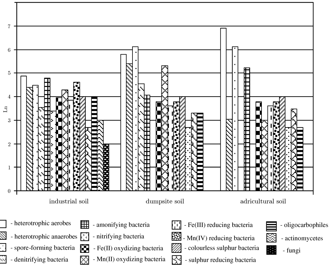
Fig. 1. Quantitative analysis of microbial communities in KCM-AGRIA soils

from the KCM chimney. The analysis of elements bound as exchange cations in soil phases shows that the most mobile and with potentially harmful effect element was Cd. Other elements presented in minor amounts as exchange cations were Cu, Zn and Mn. Above mentioned heavy metals considered to be of concern – As, Mn, Cd, Zn, Cu and Pb could readily include in the food chain and further damage the human health.