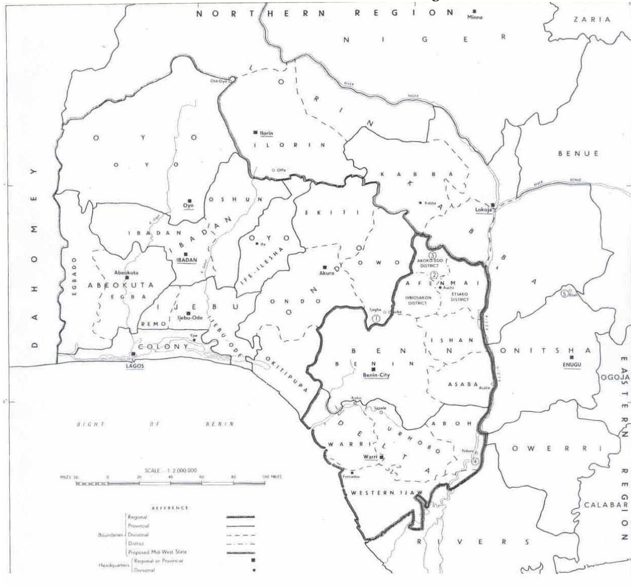
FIGURE 1. Colonial southwestern Nigeria