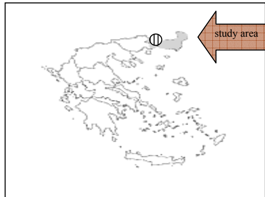
Figure 2. The study area.

For the description of the investigated destination's current situation according to the five control points, the present study took into account the opinions of the local government bodies and the residents' opinions (Brunt and Courtney, 1999; Lawson et al, 1998; Agrawal and Gibson, 1999; Kousis, 2000; Jamal and Getz, 1995; McKercher, 1993; Hjulmand, 2003). The research was carried out in the specific area by using in-depth interviews based on a predetermined questionnaire. The interviews were conducted based on the focus-group analysis technique. Eventually, 183 residents were interviewed and their opinions coded, and classified in frequency tables. In addition, a relevant desk research, nine current development studies and advertising materials were investigated, to reach conclusions regarding public policy and market management of the area.