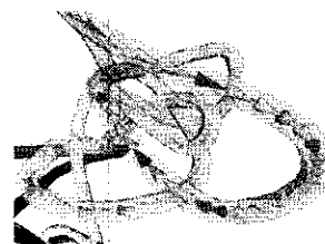
Figure 3. Zooming effect when viewer come closely

The results in Figure 3, shows that our key colours scheme can be used to allow viewer to determine a time frame at global scale with the help of those key colours. In this study also we have shown that the colour number coding scheme can be used to visualise a time frame at low level of ion trajectory. Traditionally for lower dimensional spatio-temporal datasets are often investigated using line graph, bar charts or other pictorial representation of a similar nature and animation, all of which require time-consuming and resources-consuming processes.