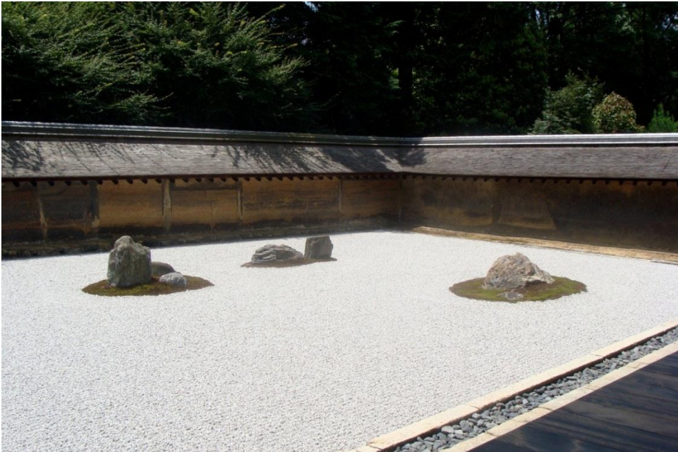
Figure 2. Zen Japanese garden, Ryoanji temple garden in Kyoto Japan.