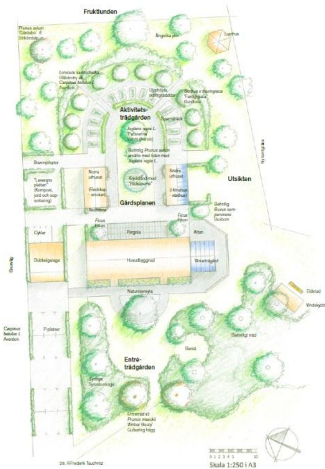
Figure 4: Sketch for Torup garden,