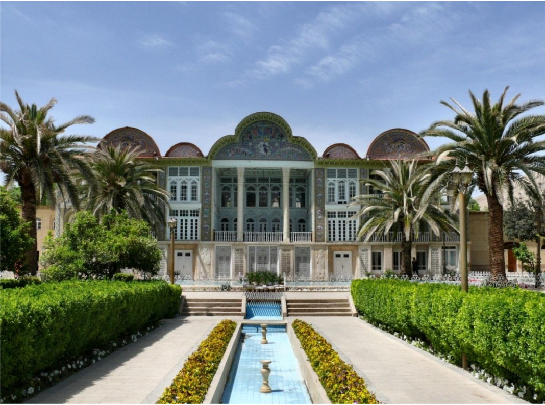
Figure 1. Bagh-e Eram, the Eram palace and garden at Shiraz, Fars province, Iran.

is one of their characteristics. Water, canopy and hill are other important elements in the garden. Symmetrical design with fountain in the intersection of the axes in the middle of the garden is another obvious character of the garden.