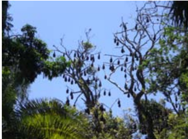
Img. 5: Grey Headed Flying Foxes roosting in a tree in central Sydney.