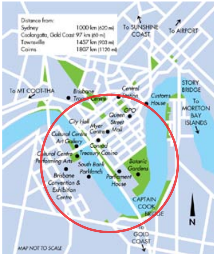
Img. 18: The case study area of Brisbane.

The study area covers the inner 3 kilometres of Brisbane City and includes the South Bank Parklands and the City Botanic Gardens.