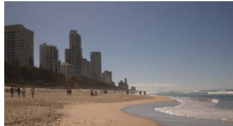
Img. 9: The famous beaches at Surfers Paradise outside Brisbane.

The humid subtropical climate with hot and humid summers and dry, mild winters makes it perfect for outdoor recreational assets all the year around. Topography and latitude have contributed to the rich biodiversity of the region, with the area occupying a transition zone between tropical and temperate zones supporting an abundance of species and habitats (SEQRP, 2009:58).