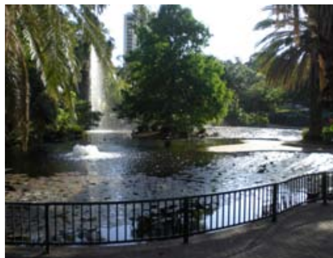
Img. 28: Water Hill Fountain.

There are several cultural and recreational activities offered in the park. Free guided walks are available twice a day from Monday to Saturday, led by experienced volunteer guides ( www.queenslandholidays.com.au ). Self-guided walks enable exploration at your own pace, including free map and a brochure. Several facilities make you visit at the City Botanic Gardens more convenience and offer shaded areas, public toilets and toilets for disabled groups, limited car parking spaces, wheelchair access, picnic tables and seats, public water taps, café and restaurant and a playground for children. In addition to the Garden's facilities, there are 10 outdoor booking areas which are available for hire and offer settings for wedding and special occasions ( www.brisbane.qld.gov.au ).