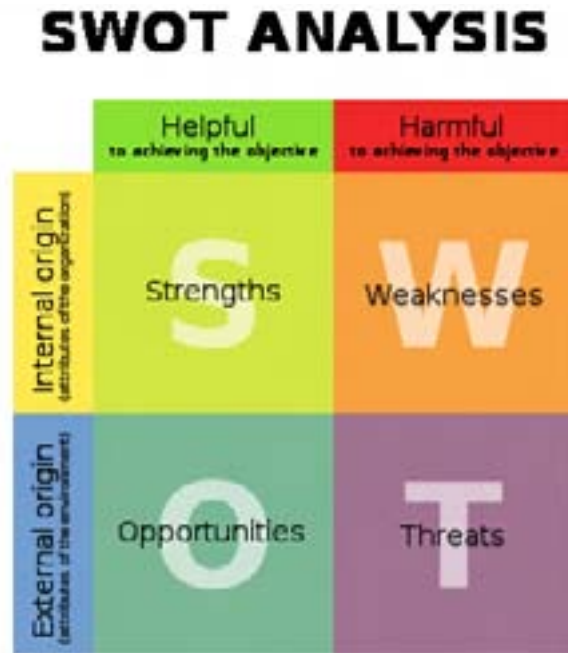
Img. 19: A SWOT-analysis consists of Strengths, Weaknesses, Opportunities and Threats.

within the park refer to challenges, future and present, which endanger and put the regions values, liveability and QoL at a risk. Hopefully the results from these methods will give materials and basic data to continue the debate about sustainable development within environmental regional planning. Other planning criteria such as availability, size, noise, variation, litter, distance etc., have been taken into account and are further analysed in the SWOT-method.