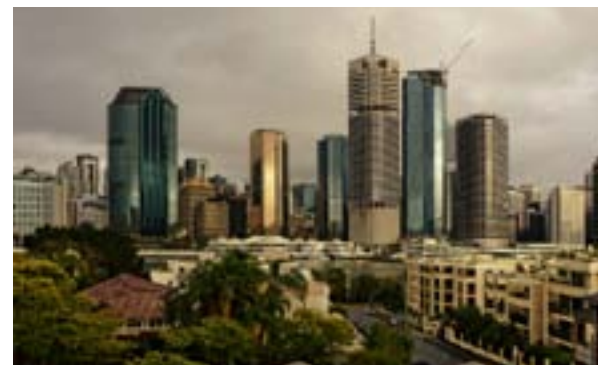
Img. 15: View over Brisbane CBD.

As discussed in previous chapters, the variety of open and disclosed structure and the emotions experienced from different design is decision making, rather than the aesthetics itself (Kaplan et al., 1998; Sorte, 2005). However, studies have found that a majority of green space users prefer a natural landscape environment, where a serene atmosphere could be experienced (Grahm & Stigdotter, 2009). It is argued that some users do not even need direct access to parks and green areas to benefit from their presence. The recreational opportunities from visualising and by passive activities are not to be underestimated (Grahm, 1991b).