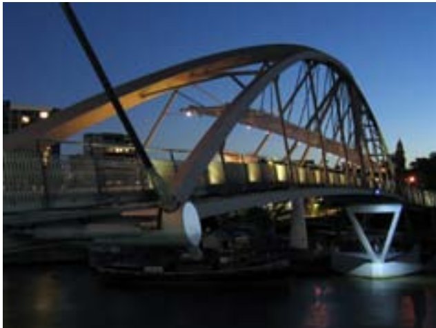
Img. 29: The Goodwill Bridge give you access to the gardens from the southern side of the city.

If walking to the City Botanic Gardens there are three entrances (Parliament House entrance, intersection of Alice and Edward Street and the Goodwill Bridge) from where you may access the gardens. The gardens reaches from Alice Street at the Gardens Point and from George to Edward Street at the Brisbane River. Opposite the River you will find the Parliament House and the Queensland University of Technology, which will guide you in a 10-15 minutes walk from the Central Business District. From the southern side of the city you may reach the site via Goodwill Bridge which was opened in 2001 and is the first pedestrian-only bridge, linking the CBD to the South Bank (BCC, 2005). CityCat and City Ferry services enable access from the riverside at the wharves of Gardens Point and Eagle Station.