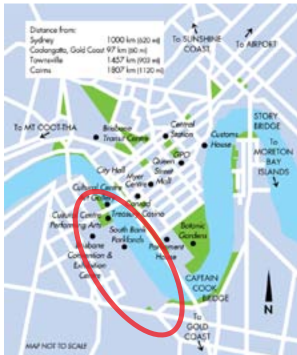
Img. 20: The South Bank Parkland location in Brisbane.

South Bank Parklands are located at the district of South Bank, directly opposite the Central Business District (CBD) and reaches along the southern side of the Brisbane River. The parklands are connected to the city by the Goodwill Bridge at the south and by the Victoria Bridge at the northern end.