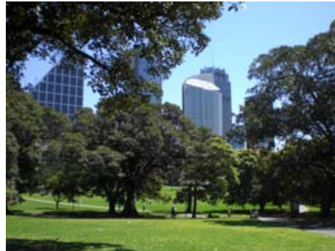
Img. 4: Royal Botanic Gardens in Sydney is popular for recreational and social activities.