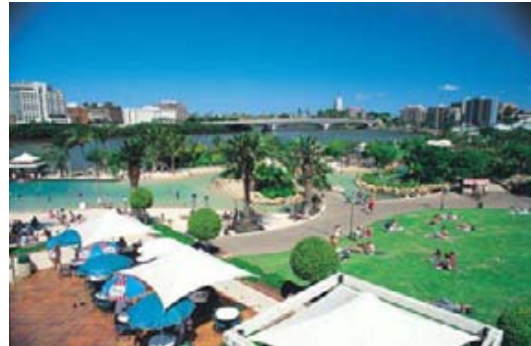
Img. 22: Overview over the parklands.

If you are entering the parklands by car there are underground carpark to be accessed via Grey Street and contain more than 800 car parking spaces ((a)www.visitsouthbank.com.au).