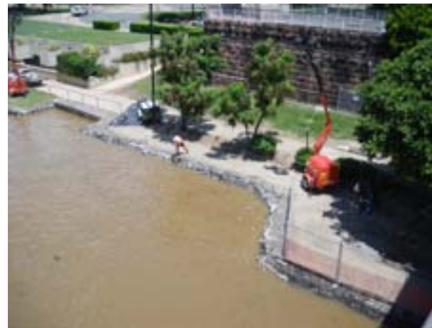
Img. 16: A worker clean up the damages from the floods in Brisbane 2011.

Recreational areas in Brisbane have traditionally been provided for passive recreation (Low Choy, 2006). It is essential that future parks are able to meet upcoming trends and needs since future needs may not be the same as current needs. The Brisbane areas that are already short of parklands, such as the inner north and south, are the ones that are expected to have the greatest development pressure (BCC, 2006). Green spaces are largely located in the western and eastern suburbs of the city and have long distances to future activity centres, which is a major challenge for urban planners.