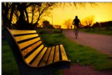
Img. 6: Most parks offer both activeness and passiveness.

Grahn (1991b) argues that green spaces are mainly used for recreational purposes, in order to make a quicker recovery from a stressful life. It is not only being active in a green environment that generates positive health effects. Passiveness in green spaces may lead to lowered blood pressure, increased ability to concentrate and less production of stress hormones (Grahn & Stigsdotter, 2003).