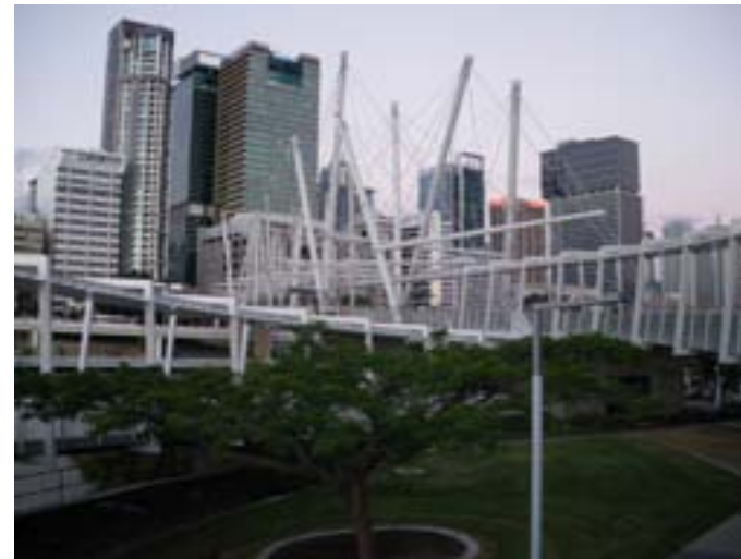
Img. 3: Kurilpa Bridge in front of Brisbane CBD.

Since more people are chosen to live in the city, the pressure on current open spaces is rising. The author Jane Jacobs (1961) claims that green spaces, in particular parks, are the most valuable, as they often stand in direct contrast to a very compact and busy city life. She argues that green areas provide the crowded city with certain functions, and agree with modernist planners who considered parks as "self-evident virtue" (Jacobs, 1961:99).