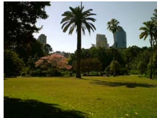
Img. 26: The Brisbane skyline from the gardens.

In 1958 the City Botanic Gardens were remodelled and the zoo was removed. Thirty years later major redevelopment started and the information center, the Mangrove Boardwalk and the Riverstage were established. At that time the former curator's residence was rebuilt into a restaurant ((b) www.brisbane.qld.gov.au ).