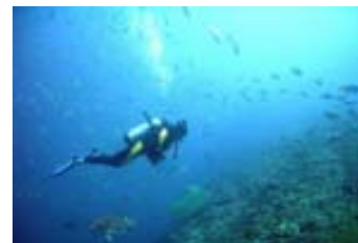
Img. 17: Climate changes are a major threat to our reefs and underwater environments.