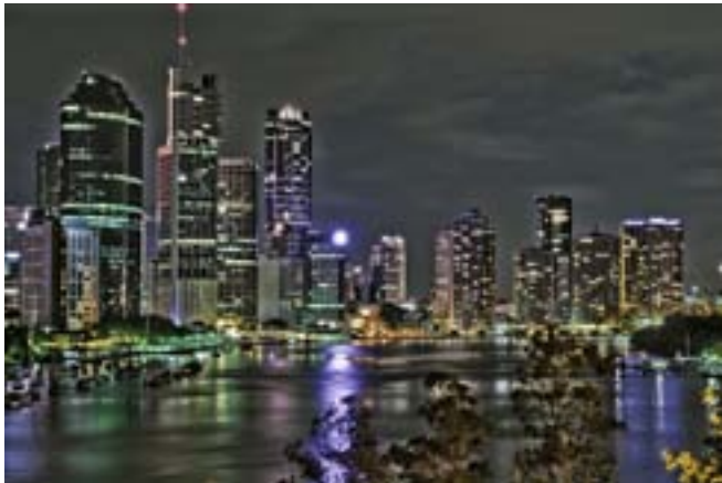
Img. 10: The Brisbane skyline at night.

tage of the mild climate and provide guests with outdoor eating facilities. However, if you want to chill out, relax or have a barbeque, there are places to be found as well, which are of great significance in maintaining the Australian lifestyle ((a)www.brisbane-australia.com).