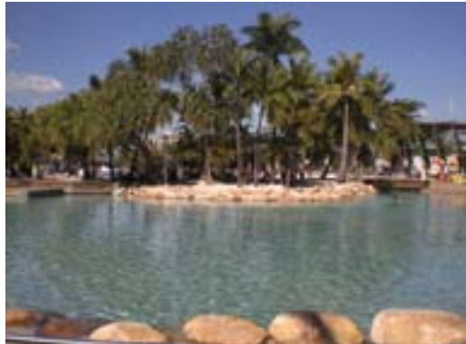
Img. 23: The Streets Beach.

The vision of connecting South Bank to the city center came to fruition in 2005, when South Bank Parklands was recognized as a part of the core of Brisbane city in the Draft City Centre Master Plan submitted by the Brisbane City Council (www.southbankcorporation.com.au).