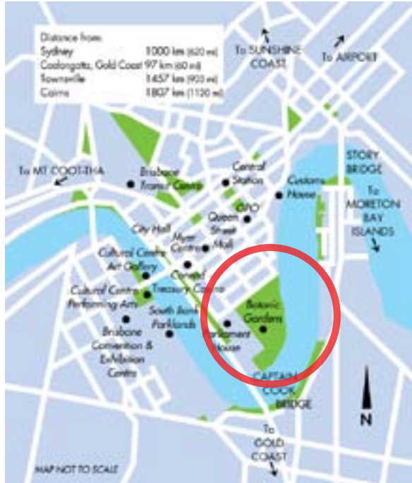
Img. 25: The City Botanic Gardens location in Brisbane.