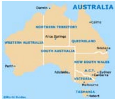
Img. 8: The Australian continent

population of over 2 million people (in March 2011), which makes it the third most populous city in the country ((a)www.abs.gov.au). Brisbane is also known as the River City, since the urban area extends in all directions along the Brisbane River, from Caboolture in the north to Beenleigh in the south, and across to Ipswich in the south. The CBD (Central Business District) stands on the original site of European settlement and is located inside a curved segment of the Brisbane River. Since the river crisscrosses the metropolitan area, the city has suffered three major floods since colonisation (Feb 1893, Jan 1974, Jan 2011) (Gunn, 1978).