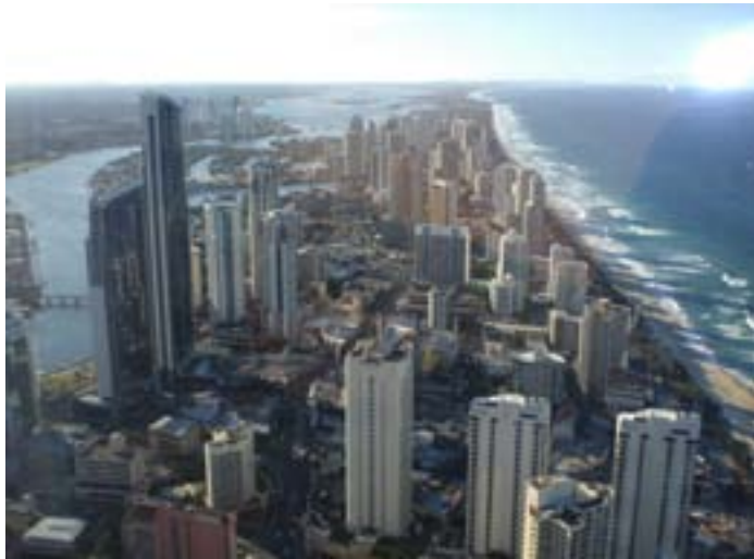
Img. 2: View from Q1, the tallest residential building in the world, over Surfers Paradise.

The awareness of including environmental concerns in the planning debate was not presented until 50 years later. At the time when Ian McHarg's book Design with Nature was published in 1967, scientists had not yet discovered the environment issues regarding man's behaviour. The book certainly played a contributing role in emphasizing the knowledge of the environment in planning, which was earlier a totally applied socio-economic process. The experts were informed of physical processes and ecological science, but had not pointed out any interests in combining values with planning. Finally the lack of theories made it difficult to address the problem of human adaptations (McHarg, 1967).