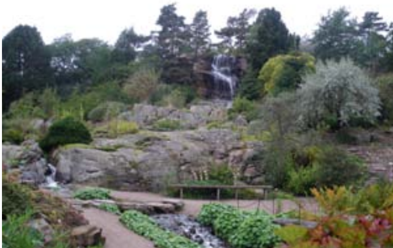
Img. 7: The Botanic Gardens in Gothenburg are rich in species.

This type of green space includes species diversity and mediates a notion of a great variety of flora and fauna, including flowers, berries, lichens, butterflies (Grahn & Stigsdotter, 2009). Adding water, dams and ponds, gives the characteristic a further dimension. This might also be associated with botanical gardens and the Garden of Eden (Grahn, 2005).