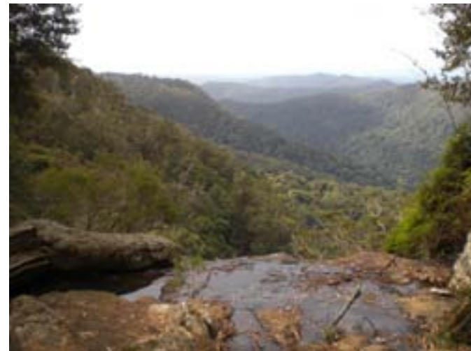
Img. 13: Beautiful view over Springbrook National Park, Queensland.

Scenic amenity is a function of what we experience by visual exposure and “is the measure of a landscape’s scenic qualities, reflecting the psychological benefit that the community derives from viewing the region’s wide variety of landscapes” (SEQRP, 2009:64). Scenic amenity qualities within the SEQ’s beaches, oceans, ranges, mountains, parks and forests are some of the assets for identifying the region.