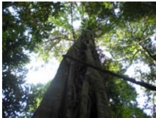
Img. 12: Native plant in the City Botanic Gardens, Brisbane.

The landscape values of biodiversity are often easy to measure and can be classified by the regional economy and environment. Single value landscape areas of great significance are identified as: “Networks of wildlife habitats and connecting biodiversity corridors designed and managed to sustain significant biodiversity values at regional and local scales” (SEQRP, 2009:58).