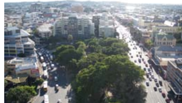
Img. 1: Urban structure in central Brisbane