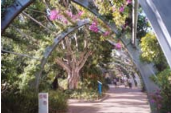
Img. 21: The Bougainvillea Grand Arbour.

South Bank Parklands hold several features that facilitate convenience such as benches, bins, shelters from sun and rain, fresh water taps, public slot telephones, evening and night streetlights and an information desk (South Bank Visitor Center).