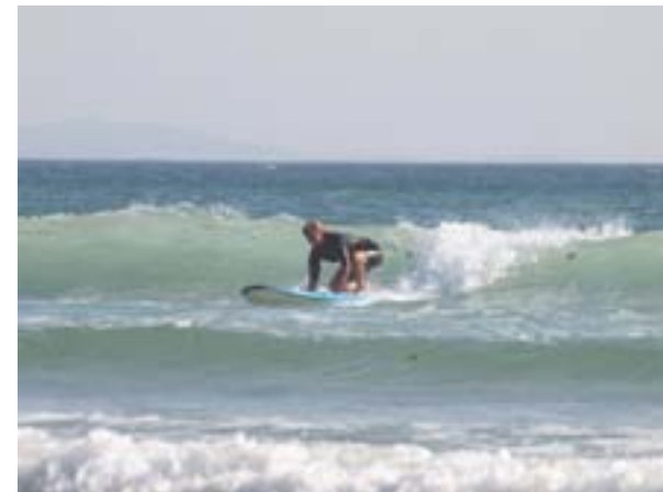
Img. 11: Surfing is an essential part of the Australian lifestyle.

and managed by a regional landscape framework. In order to protect rural landscape, the framework should address functions and activities that might have negative impacts on such values. Regarding the connection between open space and QoL, Low Choy (2009) observes: "the community places value on landscape attributes such as scenery (or nature conservation or outdoor recreation opportunities) that are derived from the open space that constitutes the regional landscape. These values determine the QoL that residents enjoy which in turn contributes to the achievement of liveability objectives that the community seeks for the region" (as cited by Low Choy in 2004:13).