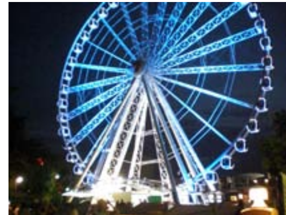
Img. 24: The Brisbane Wheel by night.

ences. However, you may find intimate, small private spaces in the parklands, but the presence of disturbances are always around the corner to remind you of a stressful and busy life in the city.