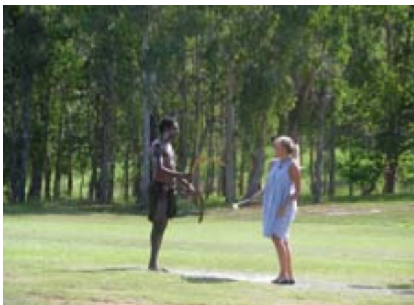
Img. 14: Discussing how to use a Boomerang with an aborigine.

The regional landscape and its urban footprint are highly valued when it comes to cultural and indigenous significance. Landscape heritage consists of non-indigenous and indigenous cultural values, which could be found in architecture, crafts, arts, design, festivals and leisure (SEQRP, 2009:83). These values may also be expressed in landscape attributes such as open spaces, facilities and infrastructure, which represent culture heritage.