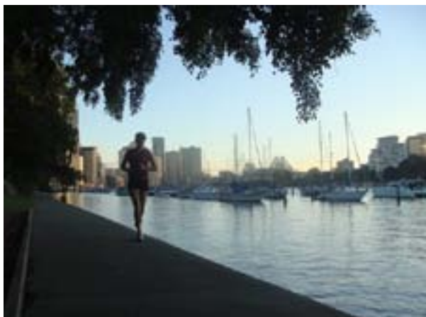
Img. 27: The river walk.

The gardens cover a 20 hectares large site of plant collections, early heritage species and present day exotic and native plantings (Murray, 2009).