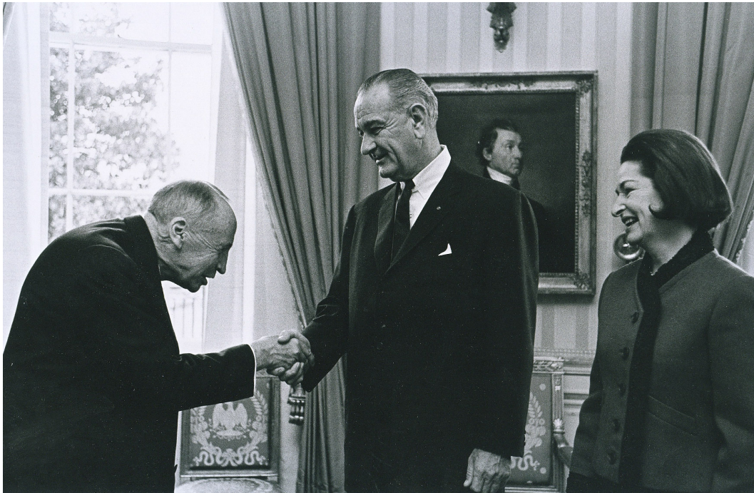
Figure 3: Van Vleck receiving the National Medal of Science in 1966 from President Lyndon B. Johnson with Lady Bird Johnson looking on.