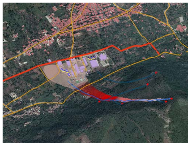
Fig.4 - Based on a 3D data animation in GIS environment a comprehensive scenario of hazards, impacts and damages has been developed.

In detail the research work, focused on an area placed inside the Municipality of Siano which includes one of the slopes potentially affected by mudflows phenomena and the LPG plant, was addressed at setting up a comprehensive scenario of hazardous events, impacts and damages. In detail, the likely chains of natural hazardous events (mudflows) and technological accidents (due to the impact of a mudflow on the plant itself) and the consequences of such coupled events on the area surrounding the plant have been analysed 5 . Although it can be assumed that the examined chains of natural and technological (na-tech) events have a low probability of occurrence, there are numerous studies showing the constant growth, in number and severity, of coupled or chained na-tech events in the last decades. By referring to the above-considered case-study, the scenario techniques have been applied to grasp the dynamic features of hazardous events over time, the complex network of relationships between the damages suffered by some elements and the trigger of likely further hazards, the mutual influences between physical and functional damages, etc.