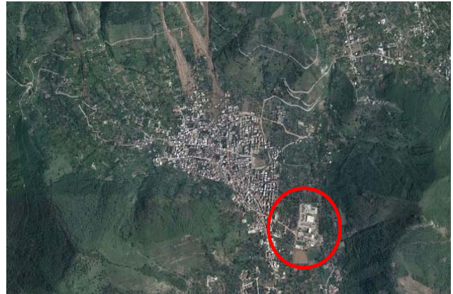
Fig.3 - The case-study area within the Siano Municipality in the Campania Region. The area is characterized by a slope potentially affected by mudflows at whose base an LPG plant is located.

In a similar way, the concept of "reliability" refers to the regular functioning of mobility network in a given time span. In case of hazardous event, such a regular functioning can be compromised, also without any physical damage to the network, because of congestion phenomena, for example, which can depend on several factors: such as network features, type of facilities served by the network, people and activities' density in the crossed areas (etc.).