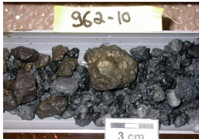
Fig. 3: Massive sulfide pebbles within hydrothermally altered wallrock.

Additionally, we mapped the parts of the Mid-Atlantic ridge surrounding the Logatchev field with a multibeam echo sounding system (Kongsberg EM120) using a reduced beam angle (22°) in order to obtain bathymetric data with a higher resolution (~20m) than previous maps. This detailed bathymetry shows a clear link of the location of the hydrothermal field to crosscutting fault structures. Dredging of a number of locations along the rift valley floor and at a circular depression close to the eastern wall recovered least-altered, partly glassy pillow basalt or fragments of basalt flows. Other dredges along the eastern rift