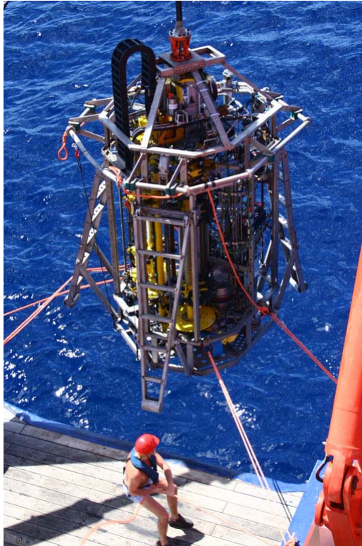
Fig. 2: The British Rockdrill 2 being lowered to the seafloor.

The mobile drilling platform used is the lander-type, remotely operated Rockdrill 2 of the British Geological Survey in Edinburgh (UK). Our main goals