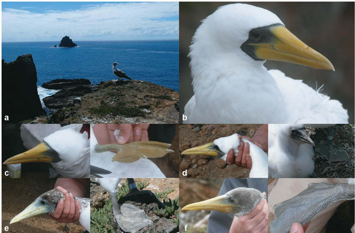
Fig 2. (a) Breeding habitat on the Kermadec Islands, fledgling Tasman Masked Booby on the nest, (b) adult Tasman Masked Booby Sula dactylatra tasmani bill and iris coloration: (c) adult male, (d) adult female and chick, (e) fledgling male, (f) fledgling female.

1990), with the mean of males lying 3% (12 mm) above those values reported from museum skins. The calculated wing SDI of 4% (male = 459 ± 4 mm, female = 476 mm) was consistent with reports for museum specimens by O'Brien and Davies (1990).