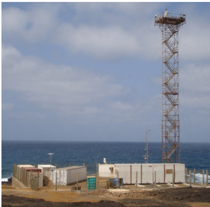
Atmospheric Station at São Vicente Island, Cape Verde. Each container is a specialised laboratory for different atmospheric measurements.

The ocean site is located 40 nautical miles “upwind” of the atmospheric site. The small Cape Verde research vessel Islandia , which has been completely rebuilt for the task, will run regular day trips out to the site. Continuous measurements are made from both an oceanographic mooring and also an unmanned glider, the latter of which sails around the mooring. The mooring is a cable which extends from an anchor on the sea floor to floats located 40 metres below the surface of the sea. A series of instruments are attached to the cable and the mooring is recovered and redeployed approximately every 12-18 months. The glider is a torpedo-type sensor platform with wings that sails on a pre-programmed course, sampling the ocean from the surface all the way down to a depth of 1,000 metres. Every few