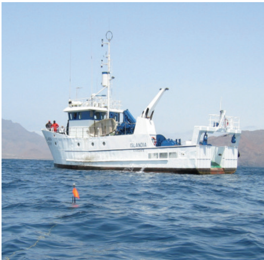
Cape Verdean research vessel Islandia off the São Vicente Island during an instrument calibration exercise in March 2008.