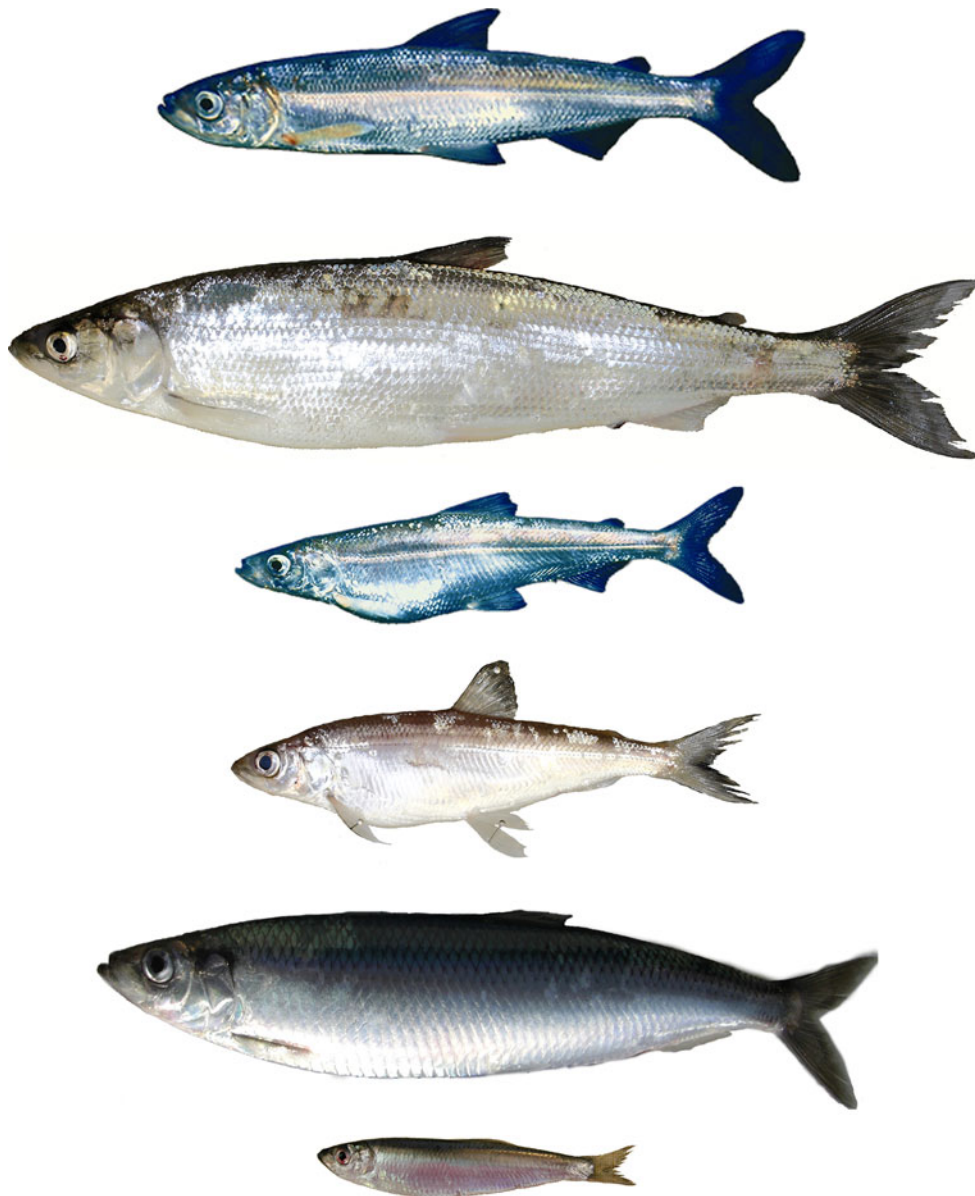
Fig. 1 Photographs of a number of coregonids and clupeids discussed in this paper. From top to bottom Coregonus albula (Lake Breiter Luzin, 120 mm total length (TL), picture: Jörg Freyhof); Coregonus artedi (Lake Superior, 386 mm TL, picture: Gary Cholwek); Coregonus lucinensis (Lake Breiter Luzin, 122 mm TL,

picture: Jörg Freyhof); Coregonus hoyi (Lake Superior, 212 mm TL, picture: Zach Woiak); Clupea harengus (Western Baltic, 285 mm TL, picture: Sophie Bodenstern); Sprattus sprattus (Bornholm basin of Baltic Sea, 123 mm, picture: Holger Haslob)