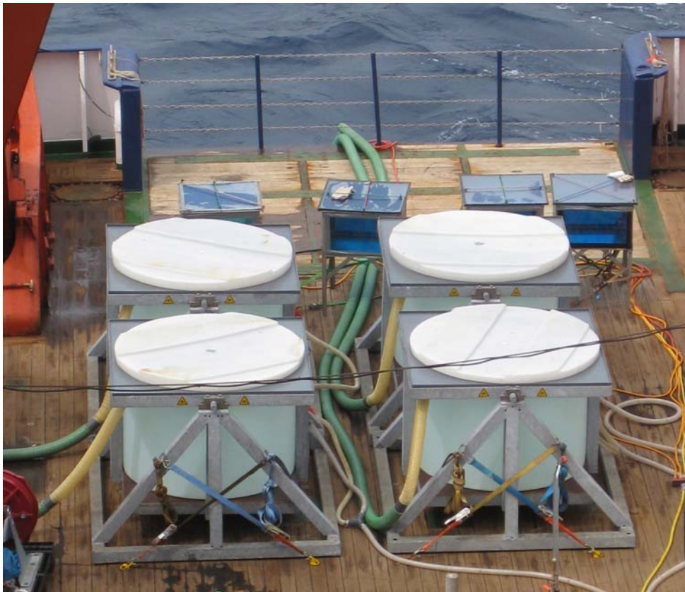
Figure 3: The after deck of Meteor during M80/2 showing the gimbaled holders for the mesocosm bags (front) as well as the on-deck incubators used for smaller volume, shorter term incubations (behind).

Three ARGO floats were deployed on behalf of the Bundesamt für Seeschifffahrt und Hydrographie in Hamburg.