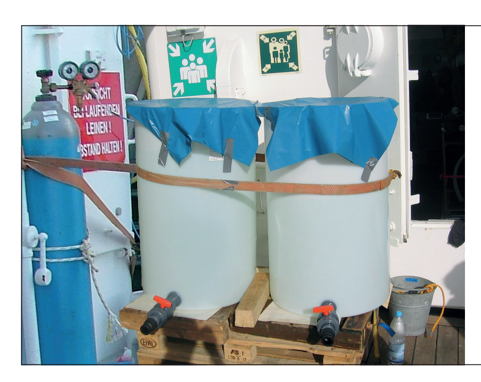
Figure 2.1 Aeration system for seawater carbon dioxide (CO<sub>2</sub>) enrichment consisting of a bottle of pure CO<sub>2</sub> gas and two 250 l seawater containers.