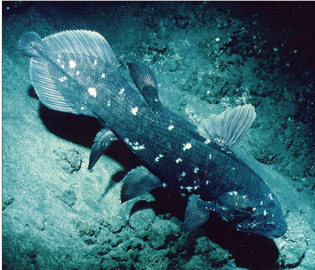
Illustrations: Fricke/Schauer (p. 14; Schauer (pp. 15; 16)