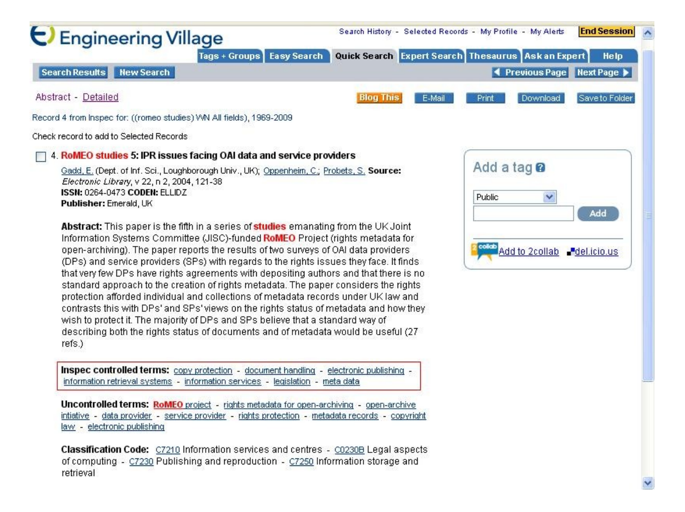
Figure 4: Sample INSPEC data for an article with descriptors.

A number of measures of analysis were used including: