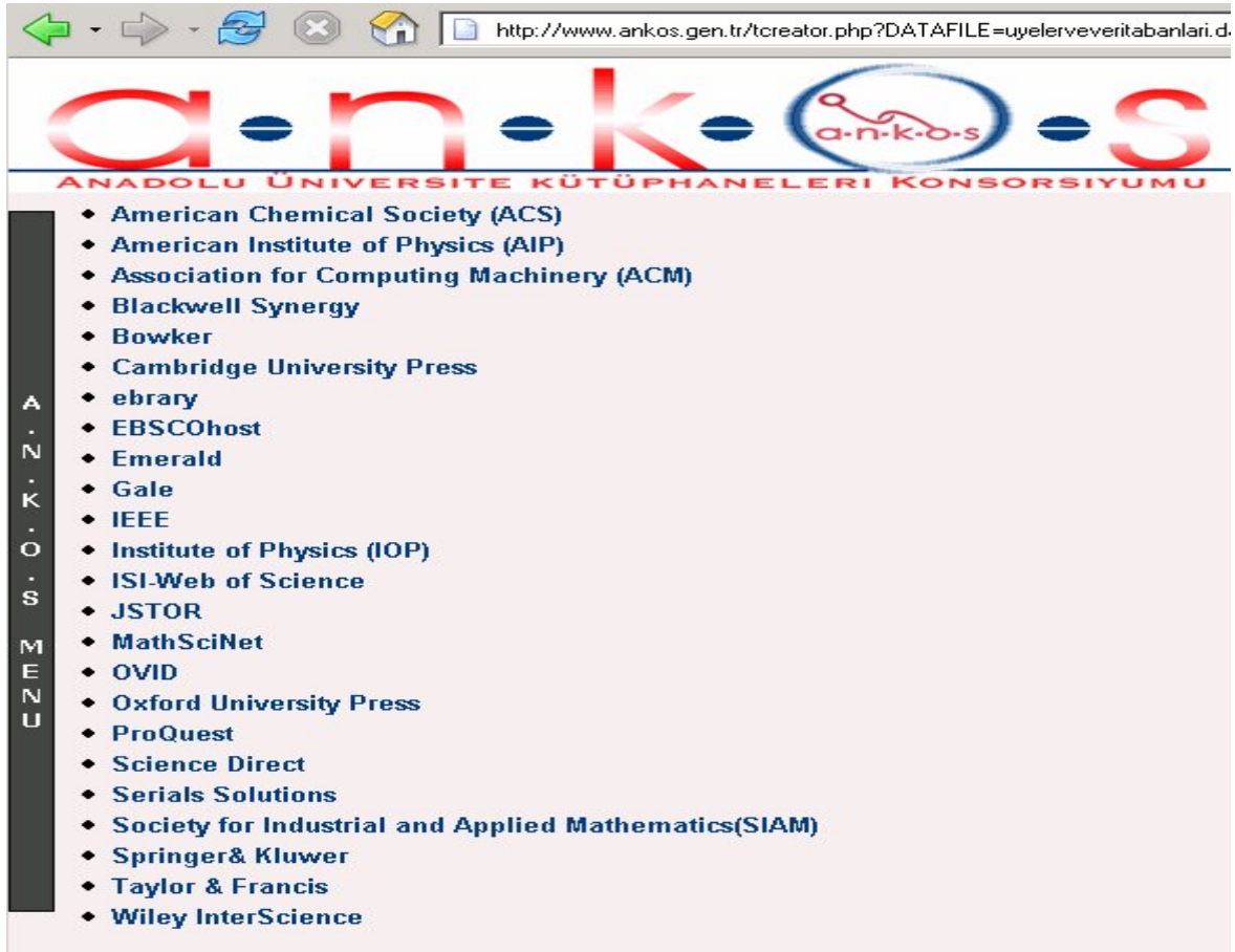
Figure 2. Databases provided by ANKOS

An important activity of ANKOS was to develop Turkish National Site License (TRNSL) model which is about the principles in usage licensing. The model was prepared by Site Licensing Group and was adopted by the ANKOS general assembly in 2002. The site license agreements are negotiated according to this model since 2003. TRNSL combines the principles of some other consortium's licensing model with the specific conditions of Turkish libraries. TRNSL provides scalability for joining new members, protects the consortium against misuse or failure of a member or a provider to conform to the rules, and perhaps most importantly, refers to the Turkish courts and legislation in case of a conflict in future (Lindley, 2003).