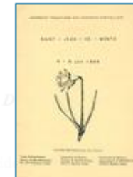
Journées Équations aux dérivées partielles (1974-2000)