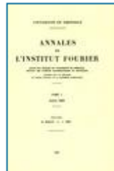
Annales de l'institut Fourier (1949-1996)