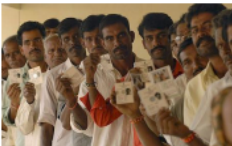
Fig. 3: Voters show their voter identity cards before they cast their ballot in Bapally, Hyderabad, 2009, photograph