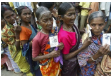
Fig. 2: Voters hold their identity cards in a queue to cast their votes in Badimunda village in Kandhamal district of Orissa, 2009, photograph, © Biswaranjan Rout/AP

Going back to the Indian political trends of the last few years, do you think that the recent option of economic liberalism will produce more results than the socialist, centralistic vision of the first decades after Independence? How would you judge the Indian present in the light of the enthusiastically promising goals listed in Nehru's 'Tryst with destiny' speech?