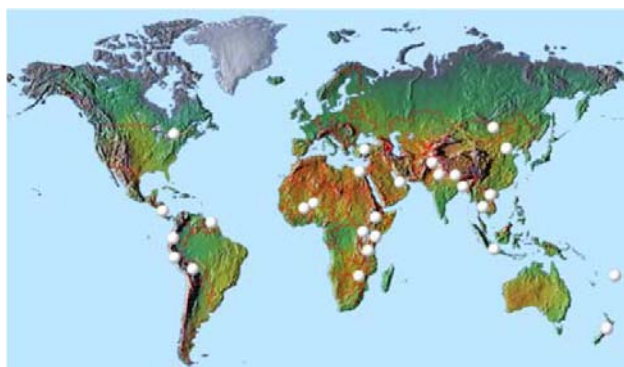
Figure 1 Organized alumni network of ITC

From its foundation in 1950 to 2006, ITC trained more than 18000 students from 171 countries. About 80-85 % of them were coming from the less developed countries; the largest numbers are from Sub-Saharan Africa, South-East Asia and Latin America (Figure 1). An overwhelming majority of them went back to their countries of origin to utilize the learnt knowledge over there.