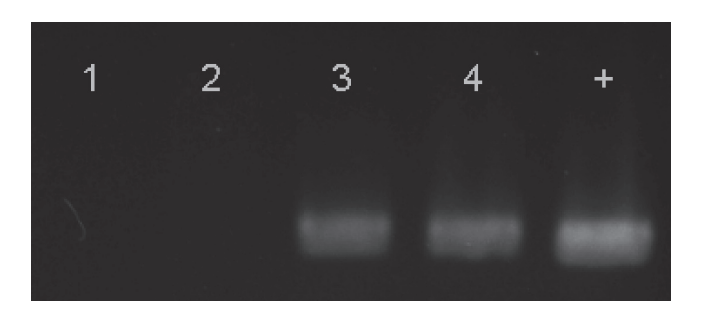
Figure 2A. Detection of a 300 bp sequence at the 3' end of the akrgene by RT-PCR. 50×diluted (Lane 1) and undiluted (2) control cDNA; 50×diluted (Lane 3) and undiluted (4) cDNA of transgenic barley; transformation cassette (Lane +).

DBC (for 1 litre): 2,7 g MS salts no NH_4NO_3 (M0238), 165 mg NH_4NO_3 , 750 mg glutamine, 20 g maltose, 5µM CuSO_4 , 2,5 mg 2,4 D, 0,1 mg BAP, 3,5 g Phytagel, 10 ml