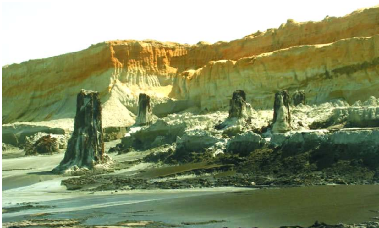
Fig. 11. Trunks are preserved in grey sand. Darker, xidized, yellow to brown sand above displayed no trace of any embedded tree. The boundary along light grey colour of sand below cross-sects the leftward dipping delta front beds dipping to north. North to left.

correlated with results of a scanning electron microscope study of wood-degrading organisms (BLANCHETTE 2000). We expect results on age of wood decay: preceding or contemporaneous with or postdating sedimentation.