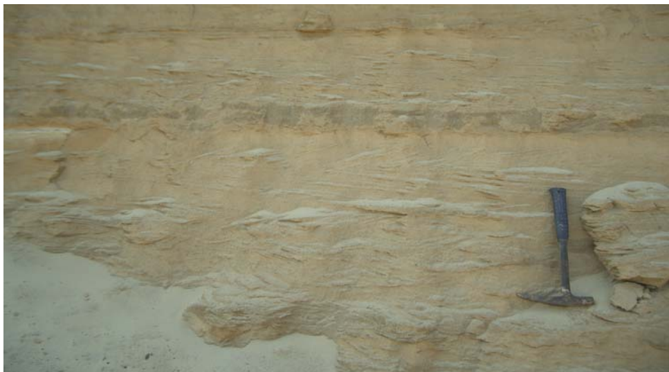
Fig. 10. Small-scale cross-bedding of delta plain.