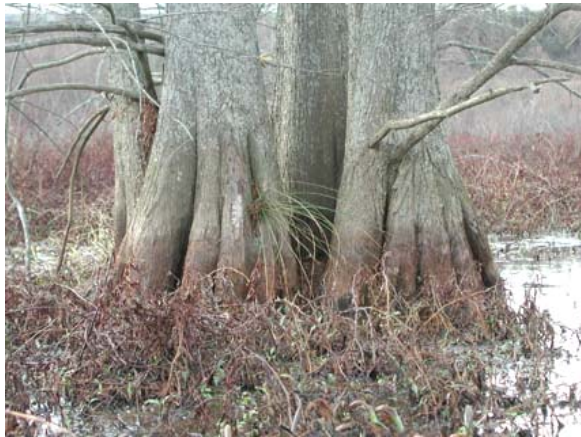
Fig. 5. Present-day Taxodium marsh in Florida – a similar forest is envisaged for the Miocene of Bükkábrány.