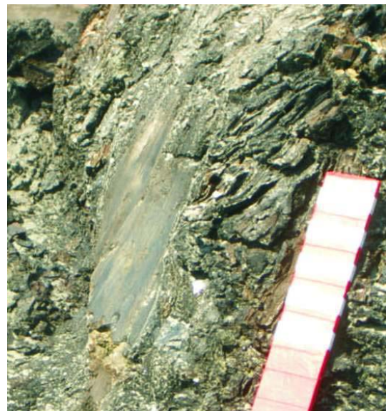
Fig. 16a and b. Shiny fault planes with slickensides (encircled above) surround some trunks: the root zone was sheared off during compaction.