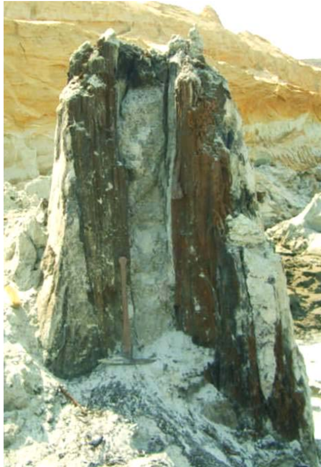
Fig. 12. Heartrot cavity filled by sand.

Other trees suffered heartrot back in the Miocene. Their central cavity has been filled by sand, or by the mineral pyrite.