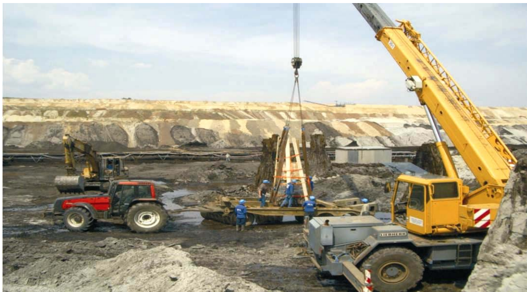
Fig. 21. Packed trunk being fixed on trailer.

sampling methods do not ensure identification of baldcypress gene. After consulting several DNA specialists it was concluded that hydrolysis of DNA underwater during 7 Ma probably severely destroyed the amino acid structure; we shall proceed with DNA analysis only if a resin pocket will be found.