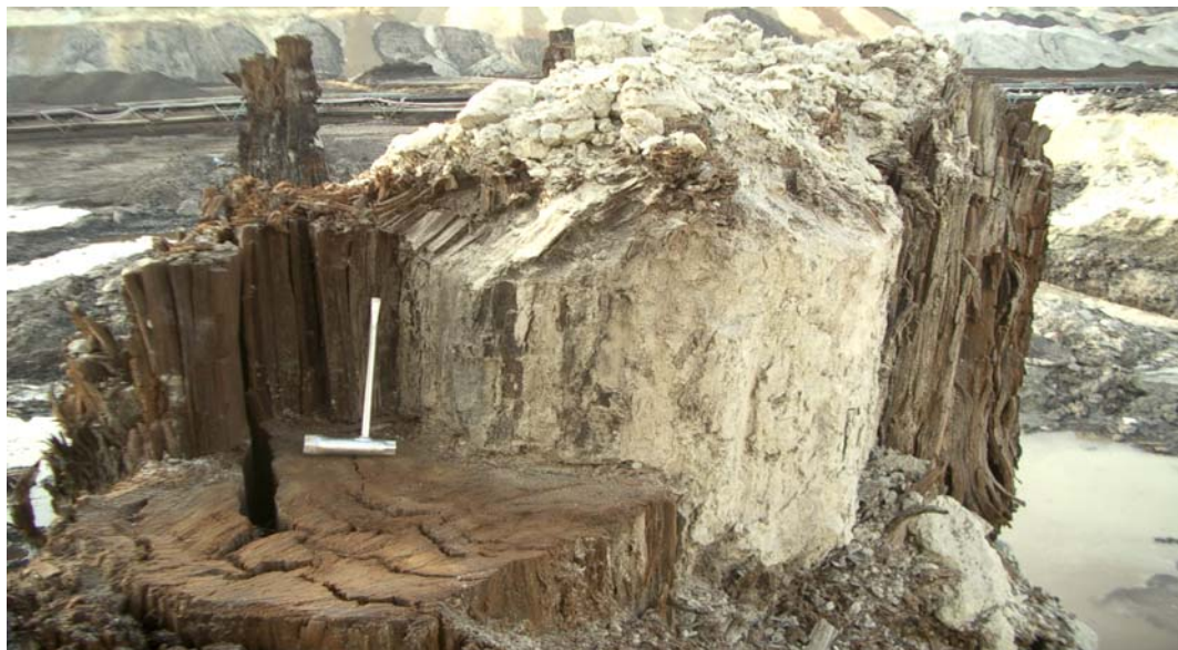
Fig. 13. Heartrot cavity filled by sand. Tangential fissures indicate a variety of degradation processes.