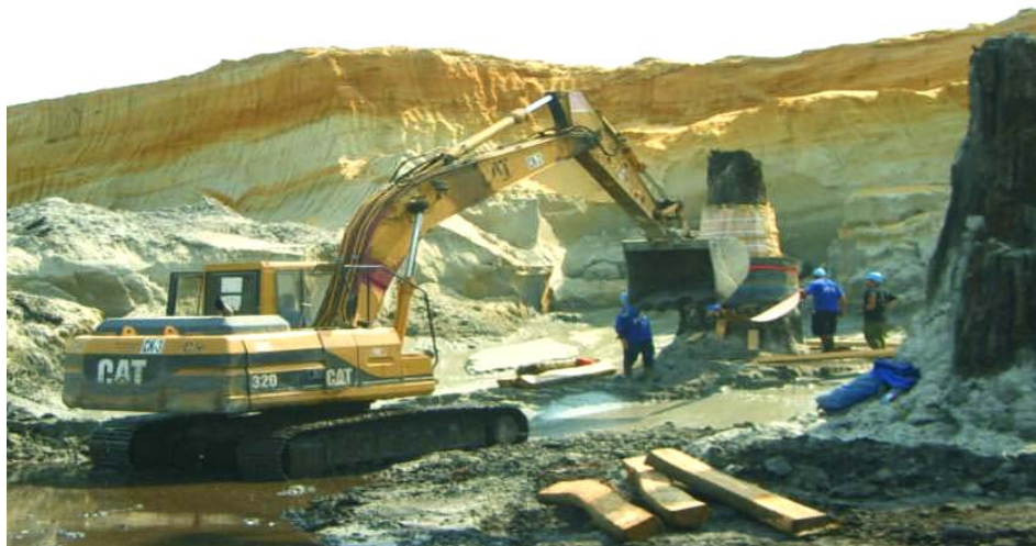
Fig. 19. Trunks are packed in preparation for removal. A tree, surrounded by planks and fastened by steel bands, is being prepared for lift-off and transport.

Alternation of regular flooding and multi-year aridity certainly leaves traces in the humic acid composition of soil.