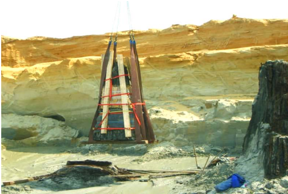
Fig. 20. Tightly packed trunks were separated from stumps by chain saw while held by a crane. This tree starts its long journey to Herman Ottó Museum in Miskolc.