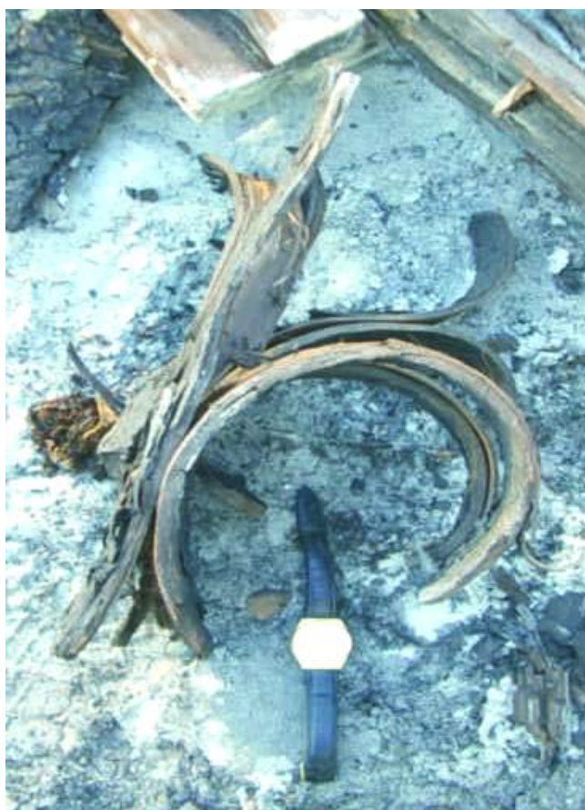
Fig. 14. Peeled-of fragments of trunks are curled while on sunshine due to low resistance of cellulose-poor degraded wood to tensile stress of evaporating water.