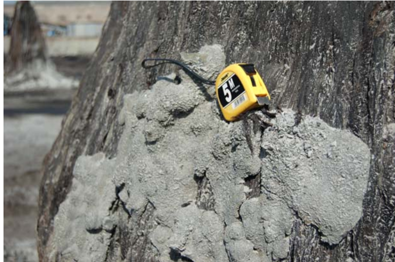
Fig. 18. Pyrite-cemented sandstone encrusting a trunk.