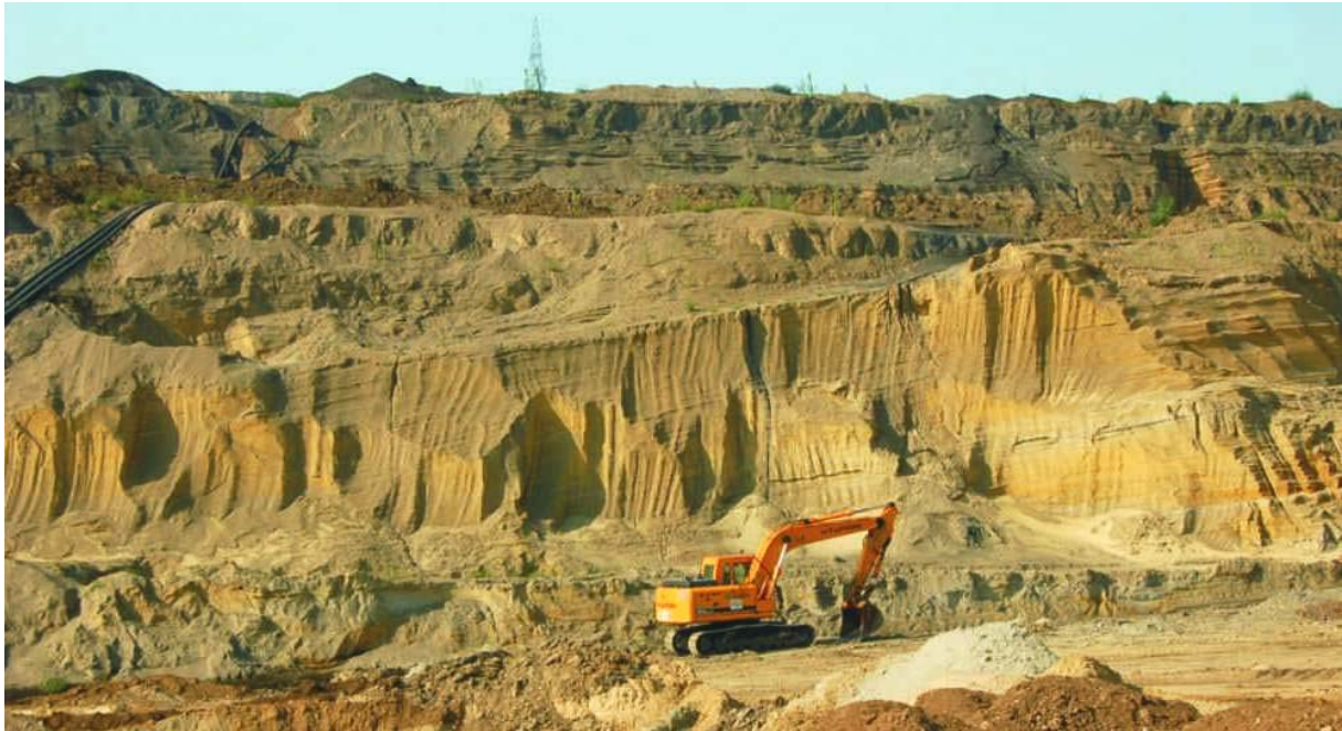
Fig. 9. Oblique beds of delta front dip to north. Amplitude exceeds 20 m.