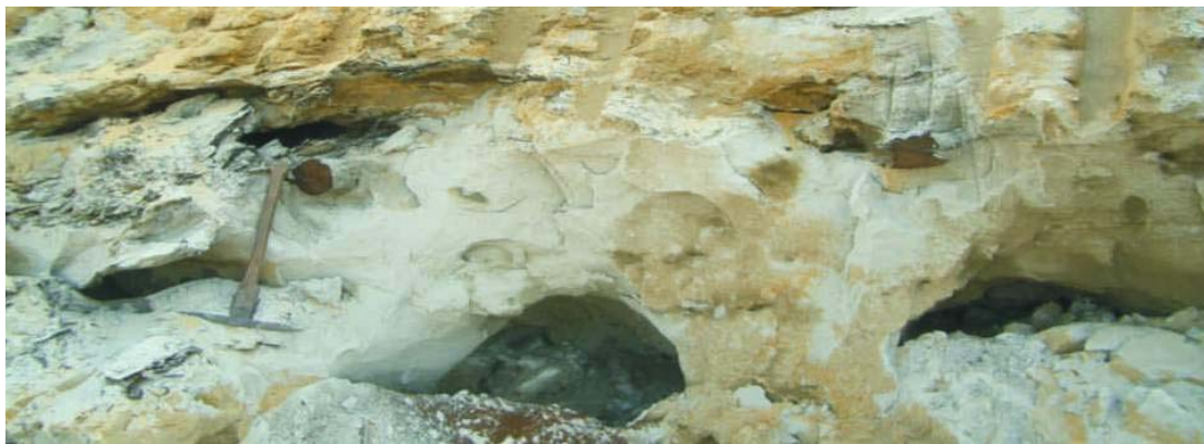
Fig. 7. Driftwood embedded at toe of delta slope.