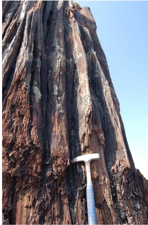
Fig. 3. Heavily ribbed trunks resemble Sequoia .

Occasionally an erect trunk was found both in Visonta and at Bükkábrány (PÁLFALVY & RÁKOSI, 1979). However, this is the first contiguous forest ever found.