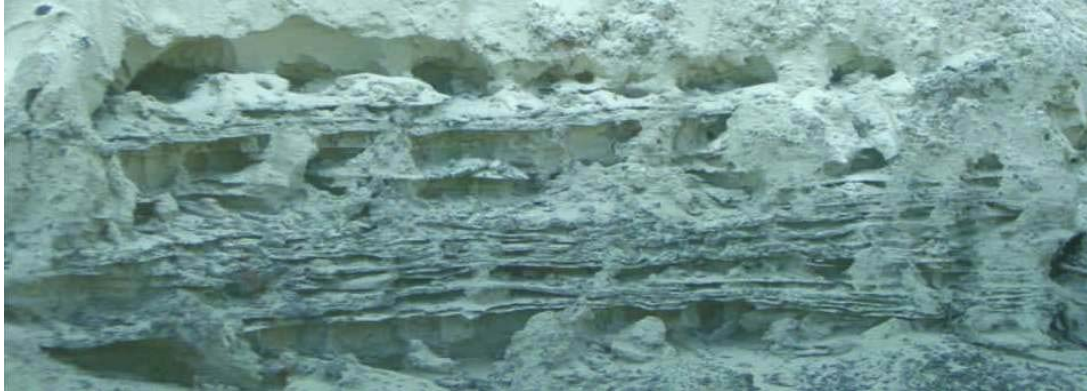
Fig. 6. Abundant organic debris outlines parallel bedding of lake bottom sediment.