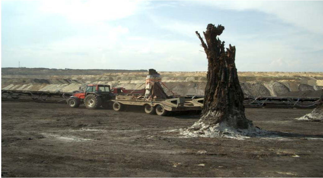
Fig. 22. Trunk in the foreground is too degraded and fragile for salvaging. It has been decayed back in the Miocene. In the background a tractor pulls a trailer with a trunk to be transported to the museum.