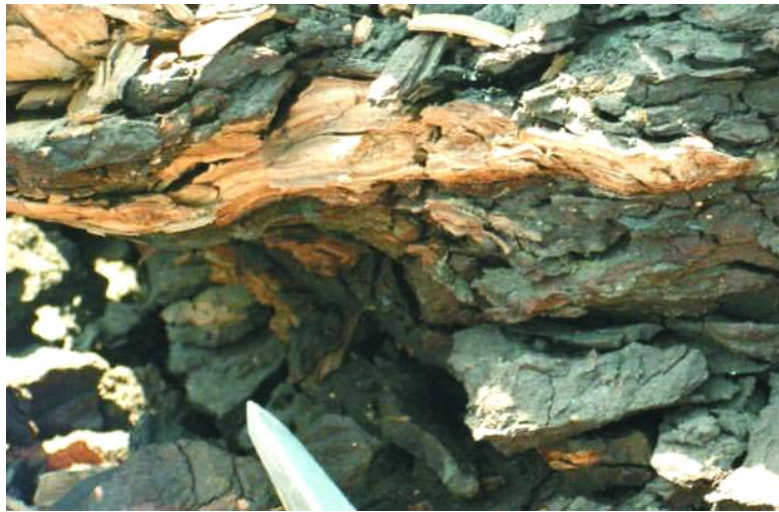
Fig. 15. Roots (?) and coarse woody debris of cypress trees preserve shape and texture. Other woody material, degraded easier, makes the 'coal'.

Four trees have been packed and removed to Herman Ottó Museum in Miskolc (Figs 18–21), where they are being conserved with various methods: covered by wet sand, kept in clear water, and in sugar solution of various concentrations. Six trunks have been treated with construction glue and various resins by staff of the Bükk National Park. These are now on display at Ipolytarnóc Fossil Park.