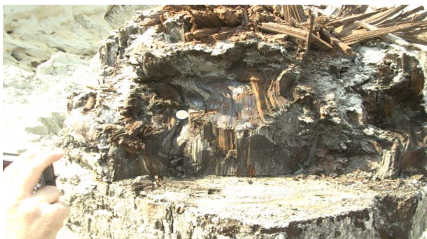
Fig. 17. Trunk folded and faulted. Wavy fibers denote zones of heavy vertical compaction in trunk; shiny, black surface is a normal fault, obliquely cross-cutting fibers at ~5 m height.

developed from the Bükkábrány material when chemical procedures make ring boundaries visible again. The next oldest scale is 50,000 years old, consisting of 1229 rings taken from a fossil forest buried by volcanic eruption (ROIG et al. 2001). This chronology will tell whether trees lived simultaneously, which were dominant, which were suppressed in growth, about recruitment periods, and other aspects of forest dynamics (SCHWEINGRUBER 1996).