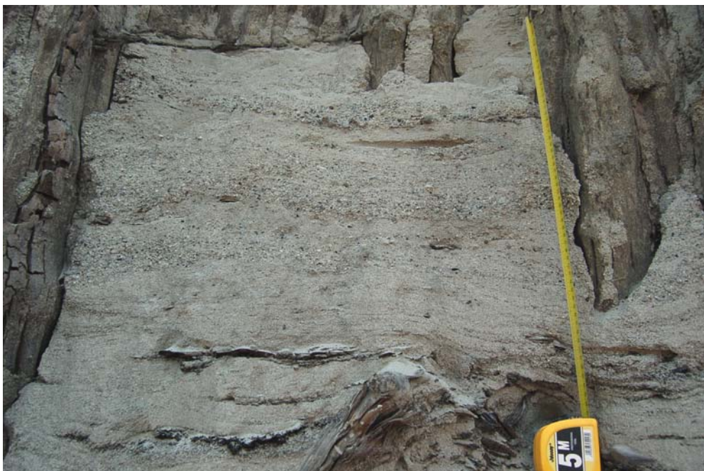
Fig. 8. Parallel pebble strings in coarse sand attached to ribbed cypress trunk at toe of delta slope.