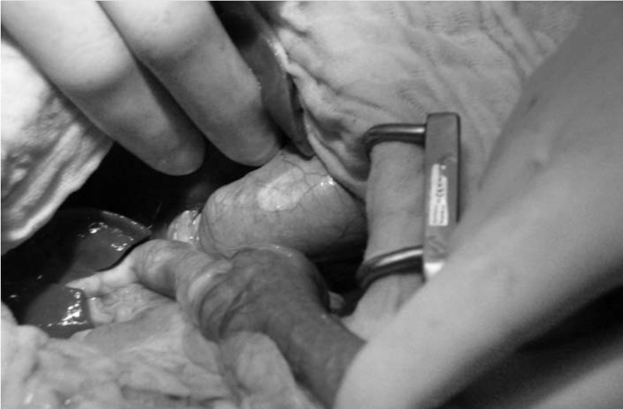
Fig. 3. Dilated biliary tree (head top); the common bile duct diameter is similar to the duodenum.