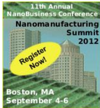
US Summit (2012)