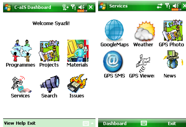
Figure 2: Features in the prototype application

are making multiple site visits. Information such as programme performance, project progress, contractual information, unfinished tasks and information relevant to the construction programme manager's current context (location and activity) can be automatically updated on his/her mobile device. This may enhance the real-time visibility of the status of projects and programmes, and allow accurate judgement and effective reporting processes in construction programme management