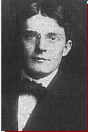
John Watson (1878-1958)

Scientific Psychology should focus on observable behavior.