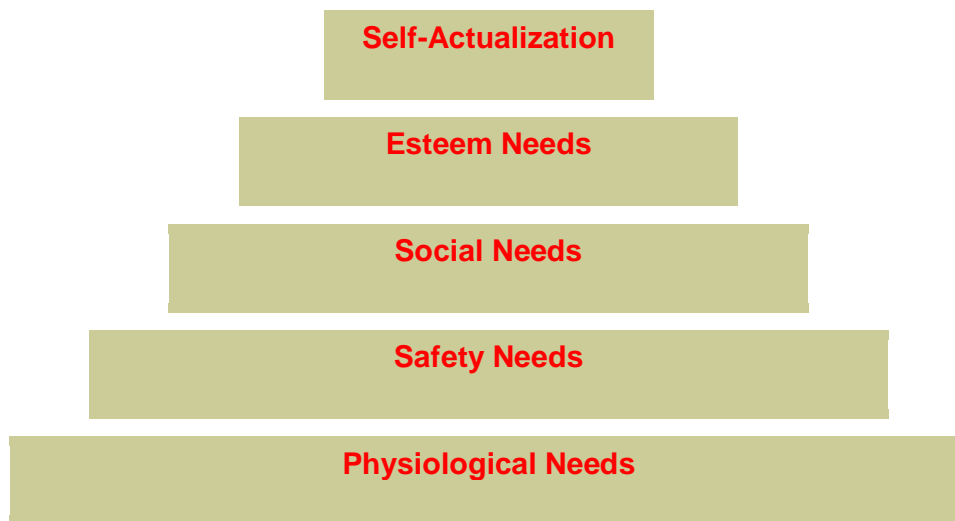
Figure 1. Maslow's hierarchical order of human needs.