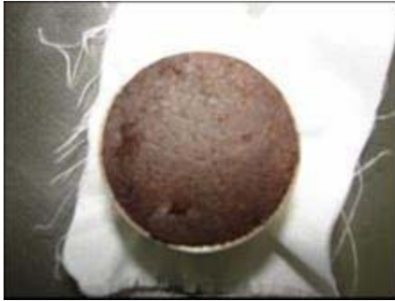
Plate 1: Sapric peat sample