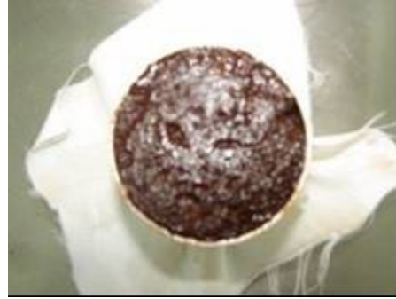
Plate 2: Hemic peat sample

transferred into moisture pressure plate chambers (Plate 4) for soil moisture determination at higher soil pressure -500 cm (-50 kPa) up to -15000 cm (-1500 kPa). A total of seven different suction head (-1, -100, -330, -500, -1000, -3000, -5000, -10000 and -15000 cm of water) were applied to the same samples in order to obtain a complete curve of the soil moisture-pressure head relationship. The treated core samples were weighed in order to quantify the moisture reduction due to the respective suction head. Eventually, at the end -15000 cm suction head, the samples were oven dried for soil moisture determination. Two different drying temperatures were applied. First, 60°C, according to Lambert and Vanderdeelen (1996) and second at 105 °C (ASTM, 1999). The soil moisture data were plotted against matric suction head to produce moisture retention curve of the sample.