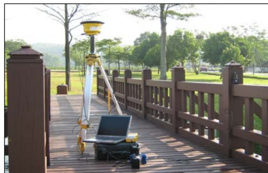
Figure 3. Overview of Instrumentation Setup

For the purpose of utilizing RTK-GPS technique, Pacific™ Cress type of radio link has been used in addition to two Trimble™ 4800 dual frequency receivers. For real time data display, real time processing scheme was adopted where positioning data from the rover is recorded directly to an on-site notebook running LabVIEW™ software. Data was collected at 1 Hz for about 15 minutes. Figure 3 illustrates the connection setup between rover receiver and laptop at P1 station.