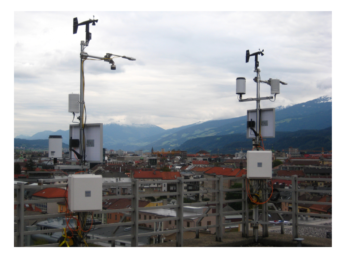
Figure 2.3: Comparing two AWS of the same type during the testing phase on the IMGI.