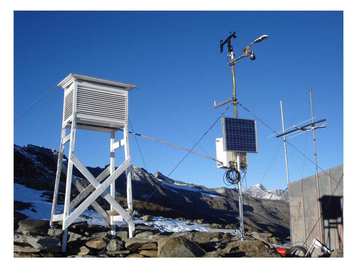
Figure 2.4: Setup of the AWS on Hintereisferner.