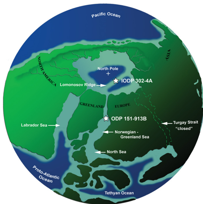
Figure 1. Paleogeographic reconstructions (Middle Eocene; ca. 50 Ma) showing site locations of Integrated Ocean Drilling Program (IODP) Expedition 302 (or Arctic coring expedition, ACEX) and Ocean Drilling Program (ODP) Expedition 151.

All samples yield well-preserved, rich palynomorph assemblages showing concentrations as high as 350,000 specimens/g dry sediment. The interval from 298.81 to 302.63 mbsf is dominated by Azolla massulae and is referred to as the Azolla interval (Fig. 2A; see the Data Repository). Furthermore, the samples yield abundant cysts of freshwater-tolerant dinoflagellate taxa, notably Senegalinium spp. (Fig. 2C) and Phthanoperidinium spp. (mainly P. echinatum ) (Fig. 2B) (Pross and Brinkhuis, 2005; Sangiorgi et al., 2008; Sluijs and Brinkhuis, 2009). The terrestrial assemblage is rich in angiosperm pollen, mainly deriving from the warm-temperate tree taxa Carya , Fagaceae, Liquidambar , and Ulmus (Fig. 2E),