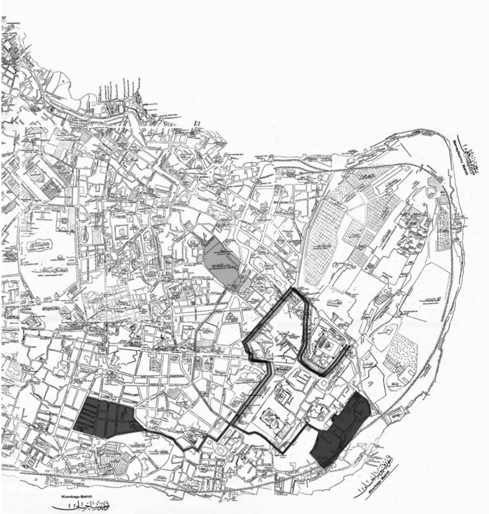
Figure 1. Map showing the routes of the 1724 processions. Reproduced from: Ekrem Hakkı Ayverdi, 19. Asırda İstanbul Haritası (İstanbul 1978).