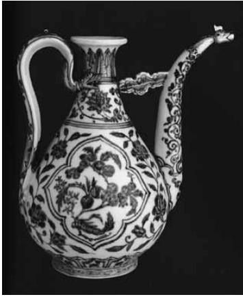
2 Blue-and-white porcelain ewer, China, early 15th century. Topkapı Palace Museum, Istanbul, 14/1410. After İstanbul'daki Çin Hazinesi (Istanbul: İş Bankası Kültür Yayınları, 2001), 95.