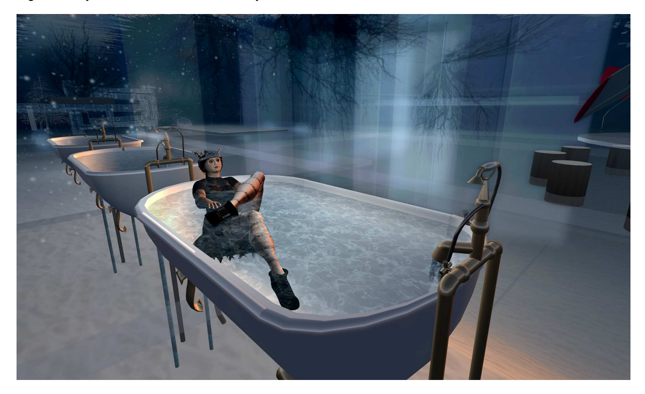
Figure 02: Syncretia: Public Baths.