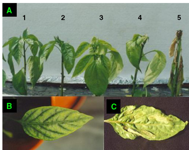
Fig. 1. Severity of leaf symptoms on 26 days old pepper plants grown in nutrient solution containing 100 mM NaCl. All genotypes were scored by using 1–5 scores. (A) Leaf chlorosis and necrosis: 1, no or very slight; 2, slight; 3, mild; 4, severe and 5, very severe). (B) Chlorosis and (C) necrotic damage on the leaf.

In the first experiment, seeds of 102 pepper genotypes (Table 1) were germinated for 12 days at 30 °C in perlite under greenhouse conditions, and the seedlings emerged were then transferred to 50 L plastic pots containing aerated nutrient solution consisted of 2 mM Ca(NO 3 ) 2 , 0.88 mM K 2 SO 4 , 1.0 mM MgSO 4 , 0.25 mM KH 2 PO 4 , 10 μmol H 3 BO 3 , 0.5 μmol MnSO 4 , 1 μmol ZnSO 4 , 100 μmol Fe EDTA; 0.2 μmol CuSO 4 and 0.02 μmol (NH) 6 Mo 7 O 24 . Nutrient solutions were renewed every 3 days. The pepper plants were grown in the nutrient solution without salt treatment up to 6–7 true leaf stage (14 days after transfer to nutrient solution). Then, NaCl was supplied as 25 mM increments every 12 h until a final concentration of 100 mM (10.9 dS/m at 25 °C). The plants were grown for 10 days under 100 mM NaCl. On day 26 in nutrient solution, genotypes were scored and classified according to the severity of leaf symptoms caused by 100 mM NaCl by using a 1–5 symptom scale (Fig. 1). As shown in Fig. 1, severity of leaf symptoms (leaf chlorosis and necrosis) was ranked as following: (1) no or very slight, (2) slight, (3) mild, (4) severe and (5) very severe. Based on the severity of leaf symptoms, six