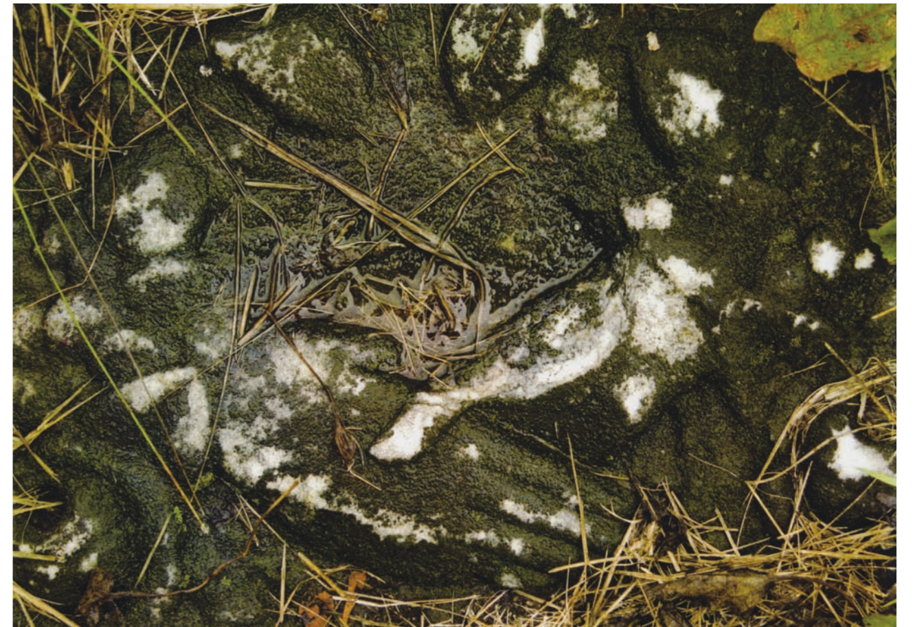
Figure 1: David Morrish, page from bookwork, DIED, CMYK photogravure print on Somerset, 17.6 x 22.6 cm, 2009.

David Morrish – bookwork: DIED. In an initial prototype version, this artist's book contains one black and white photogravure, one four-colour photogravure and an intervening sequence of four digital inkjet prints with an embossed title page and a letterpress colophon. The point of mixing media was to examine the transformation from the photographic document to the physical impression. I was interested in the surfaces of the aging gravestones and the details of the incised letters of the word "DIED" on these stones and how they were physically echoed in the media used for the bookwork. As in past work, I assumed there would be a transformation from the