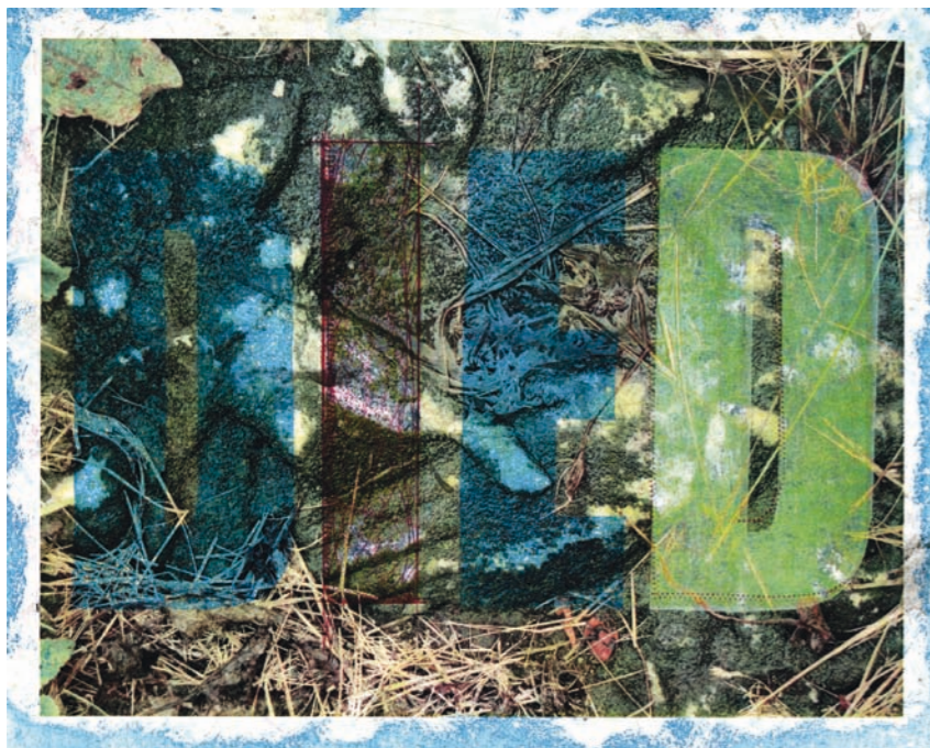
Figure 2: David Morrish, "DIED" reprint from altered CMYK gravure plates used for Figure 1, 19 x 24.5 cm, 2010

image to a point far from mimetic as the separation colours reassert themselves in ink within the colour layers of the print.