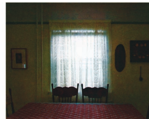
Figure 6: Marlene MacCallum, 66CS and 61EVR from the in-progress book work Townsite Layered , four-colour photogravures, 14 x 17.6 cm, 2009