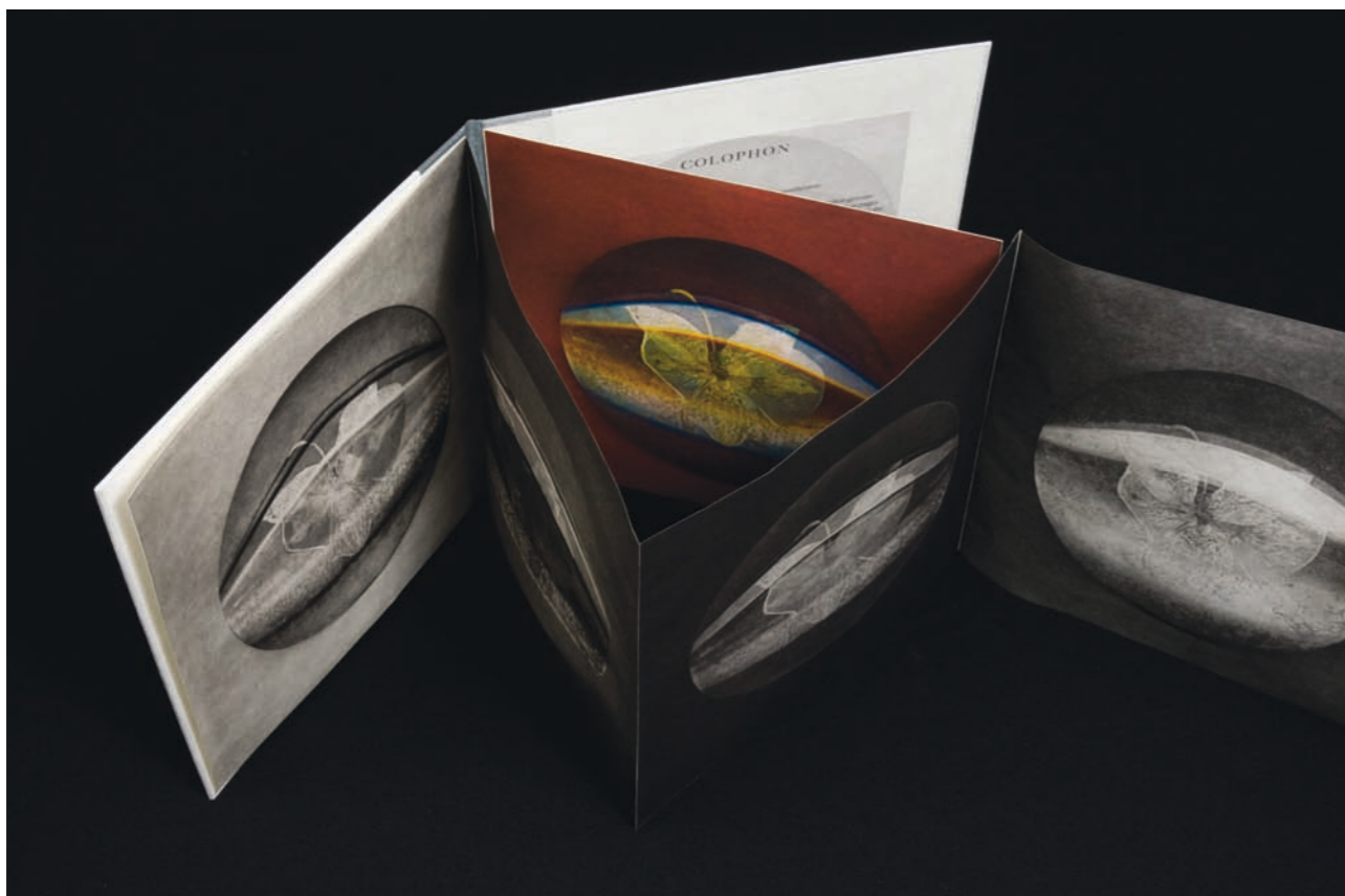
Figure 5: Marlene MacCallum, Quadrifid , view from above of the two sections showing the four colour separation plates printed in both black and colour, hand bound bookwork, 28.5 x 27.7 cm (page size), 2009

mode. Since then we have gained a level of control where we can produce four-colour photogravures that are mimetic to the image source. This provides a new challenge in identifying the distinct necessity for four-colour photogravure.