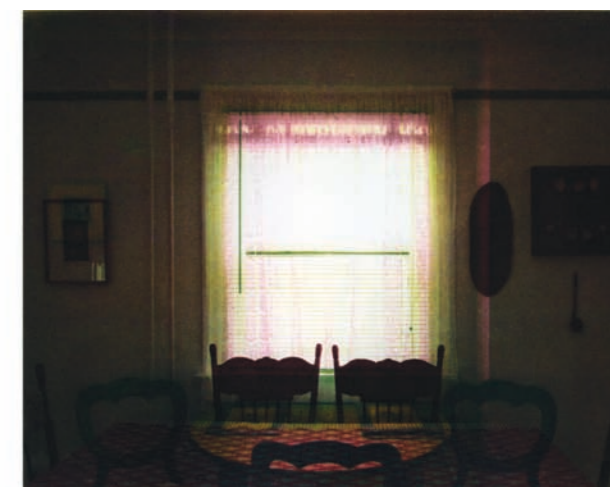
Figure 7: Marlene MacCallum, 66CS Pentimento and 61EVR Pentimento from the in-progress book work Townsite Layered , multi-plate photogravure variations, 14 x 17.6 cm, 2009

addresses the deceptive nature of appearances. A variety of multiple producing technologies were used in creating the source images and as such the piece has a secondary theme on the impact of these processes on the resulting image. The final images, however, will be primarily photogravures; either four-colour or black & white. In this instance, the distinctness of the photogravure surface serves to create visual coherency. By compressing the images into one type of visual surface, the difference between the image sources is played down and the eerie similarities are enhanced.