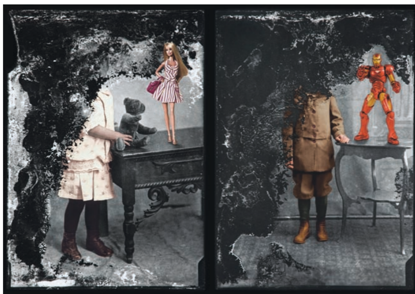
Figure 3: David Morrish, girl/Barbie and boy/Ironman, photogravure over inkjet on Entrada, each 37 x 26.5 cm, 2009

the two layers is less critical and to create a slight overlap to compensate for error. Old printing traditions or tricks are best remembered, I suppose.